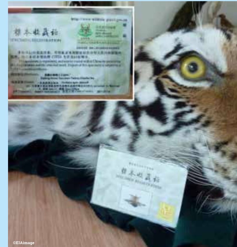
China allows the skins of captive bred tigers to be turned into rugs and taxidermy items. The taxidermist offering this skin to investigators explained how the licensing system could be used to launder illegally sourced skins

There is an obsession with breeding white tigers in captivity accompanied by spurious claims about it being in the interest of the "species" conservation. True white tigers are Bengal tigers ( Panthera tigris ), bred to display a recessive gene. There is no conservation value in breeding them, nor is there any conservation value in breeding them with Siberian tigers.