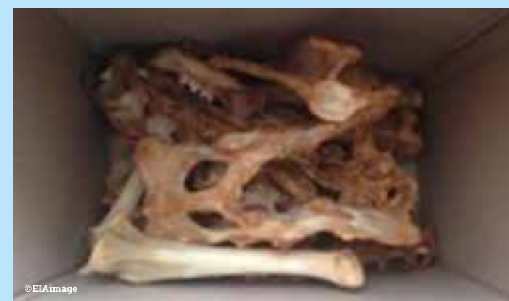
Above and below: tiger bones and skull for sale at retail premises, 2016