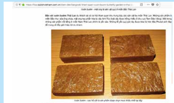
Tourism website touting the availability of tiger bone glue