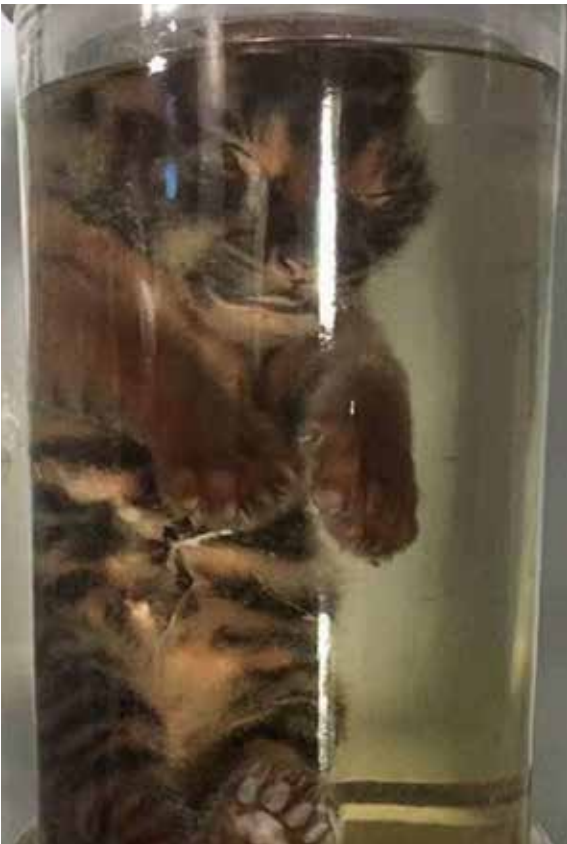
Left: Trade in dead tiger cubs is thriving as a result of unregulated breeding, poor husbandry and inbreeding, causing high infant mortality. Cubs are put into jars of liquor or wine and mixed with other ingredients such as snakes, scorpions, pangolins, bear paws and ginseng. Popular among Vietnamese consumers.

The various CITES Resolutions and Decisions since 1994 also call for, inter alia, more effective enforcement cooperation 8 . This includes the sharing of images of seized tiger skins with Parties which have tiger stripe pattern profile databases from camera-trap images of wild tigers and/or captive tigers. The purpose is to facilitate law enforcement investigations and the process involves relevant law enforcement agencies taking high resolution photographs of skins from above. There are no significant costs and no need to share sensitive information. India and Nepal have cooperated over the process, but by all accounts there has been poor cooperation from other countries despite a minimum of 104 skins being seized (outside of India and Nepal) since this recommendation was first adopted in 2016.