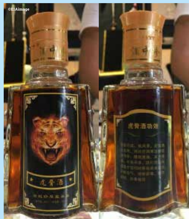
Tiger bone wine for sale in the Vientiane shop

Tiger bone and tiger bone wine being sold by this company are pictured right.