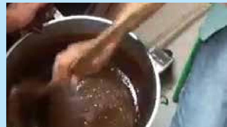
... their bones boiled for three days ...