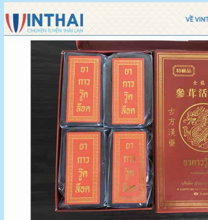
Website vinthai.net advertises “Thailand tiger bone glue”

In 2002, it was reported 39 that the company confirmed it had been legally allowed to manufacture tiger bone products under the Thai Food and Drug Administration and had in fact sourced tiger bone from Myanmar, which would have been in contravention of CITES. It went on to say that it would recall all tiger bone products (it was making nine different products at the time) and would replace tiger bone with a herbal alternative in future production.