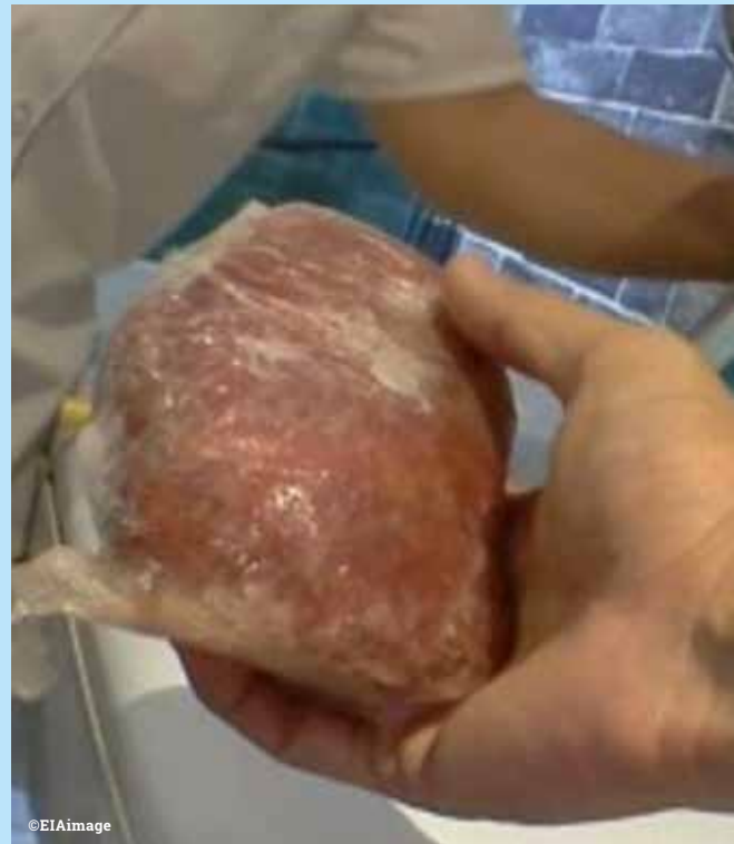
Tiger meat is consumed as an exotic delicacy

In September 2019, a tiger head and tiger meat was seized alongside bear paws, porcupines, giant salamander and other wildlife from a freezer at a Zhejiang hotel. The hotel owner had a sideline in selling exotic meats and had sourced the tiger from contacts in zoos; the tiger in question had reportedly died of pneumonia in 2016. 87