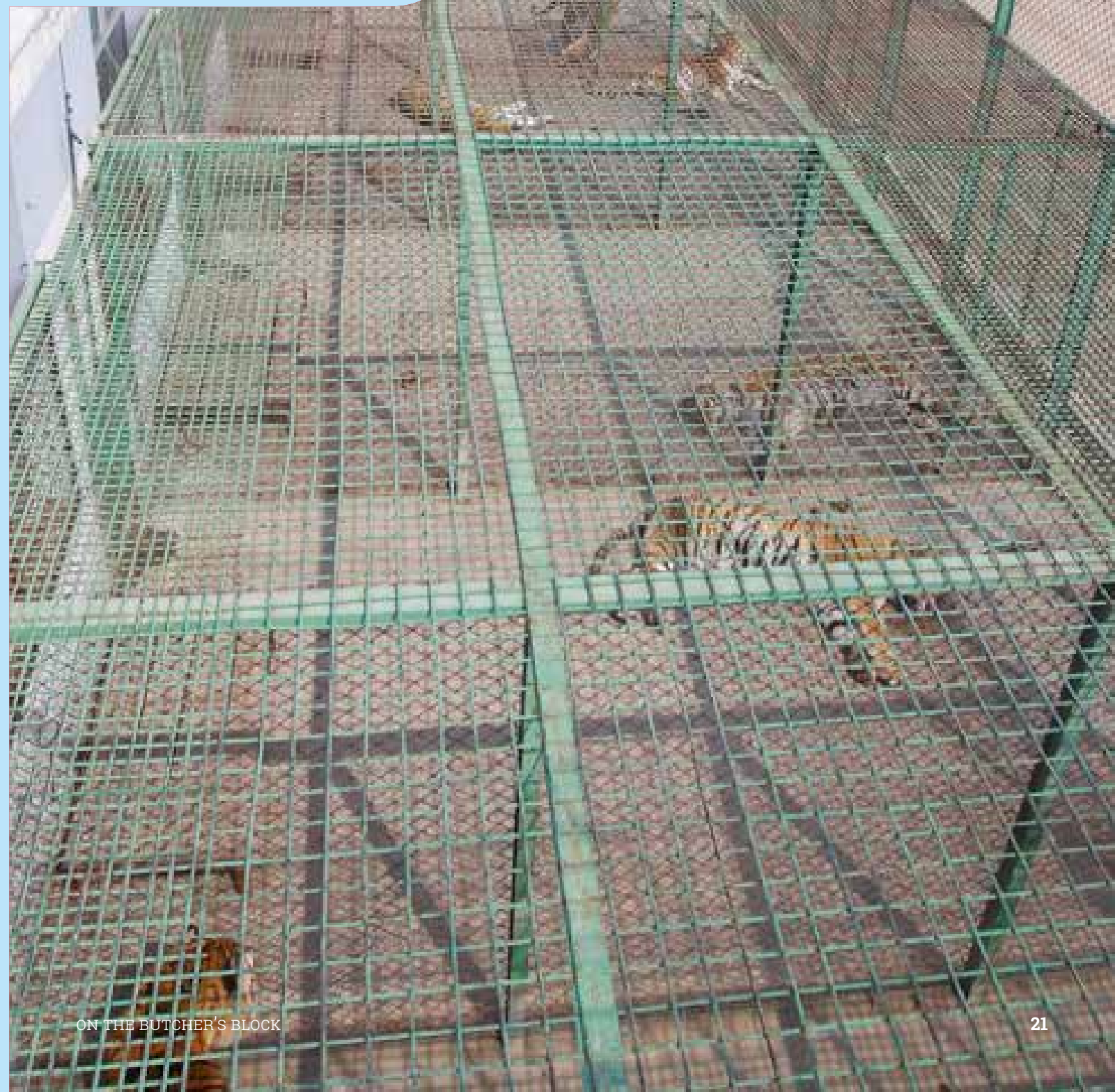
ON THE BUTCHER'S BLOCK

Far right: captive tigers at one of China's largest speed-breeding farms