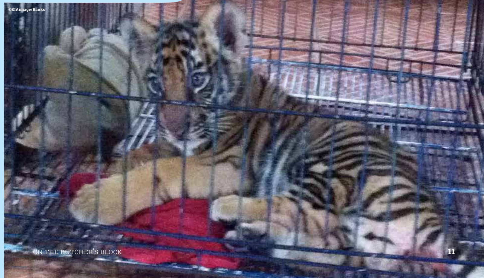
ON THE BUTCHER'S BLOCK