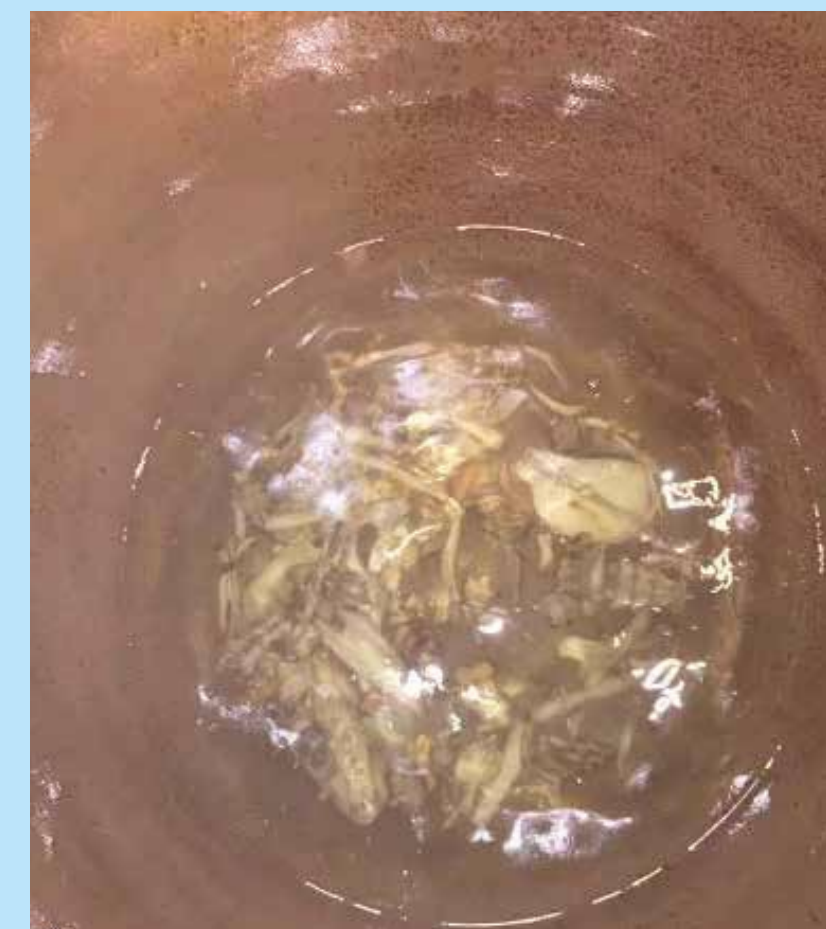
Image of tiger bone wine manufacturing process, shared on social media by company