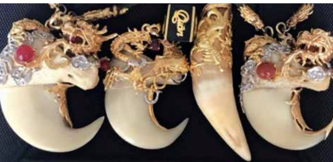
Below left: Teeth and claws are fashioned into expensive jewellery worn as a status symbol