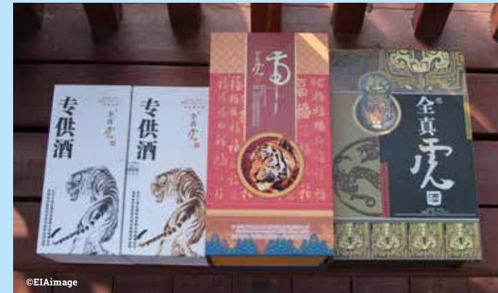
Sanhong's "Real Tiger Wine", made with captive tiger bones, which they claim they have permission to make, China