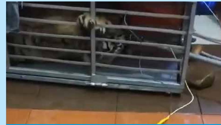
Captive tigers are electrocuted ...

There is clearly more that authorities in Vietnam can do to investigate the footprint of Vietnamese tiger traders in the region and further afield, including following the money associated with those in the trade that they have already arrested and convicted. Upcoming CITES missions to Vietnam presents an opportunity to address the lack of enforcement in Nghe An Province and the need to further restrict who can keep and breed tigers.