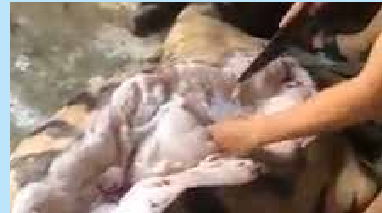
... skinned and butchered ...