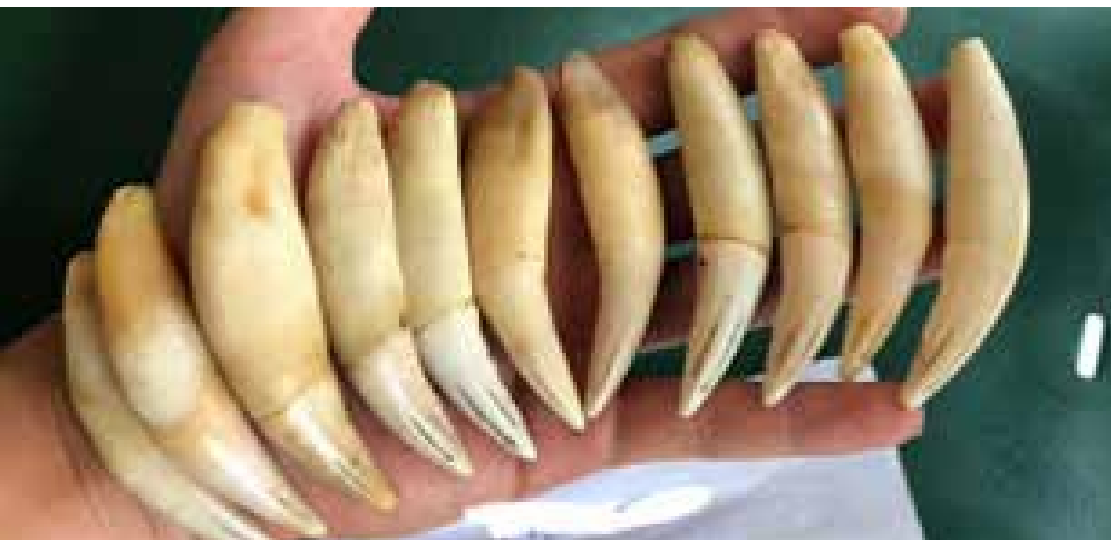
Left: Unworked tiger teeth for sale online from Vietnamese trader

The impact of continued demand, the failure to stop tiger farming and the increase in recorded incidents of trade in captive-bred tiger parts are among issues highlighted in two detailed and substantive reviews prepared for the CITES Parties by a trade expert in the IUCN Cat Specialist Group in 2014 23 and 2019. 24 The reviews documented both shortcomings and good practice across Asian big cat range and consumer states in relation to legislation, enforcement and demand reduction.