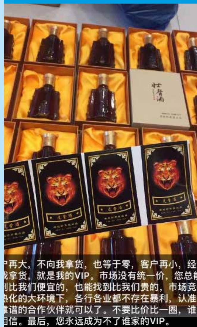
Tiger bone wine for sale on the company's social media account