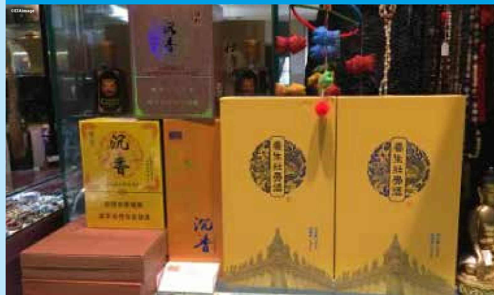
Tiger bone wine for sale in the Vientiane shop