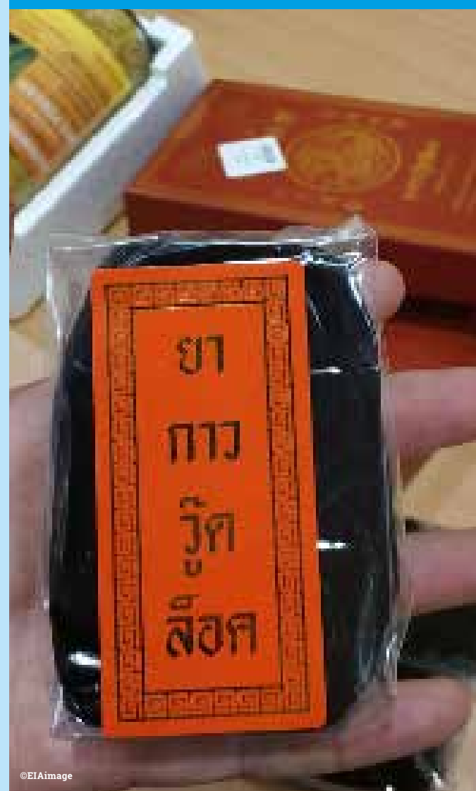
‘Tiger bone glue’ on open sale in Thailand