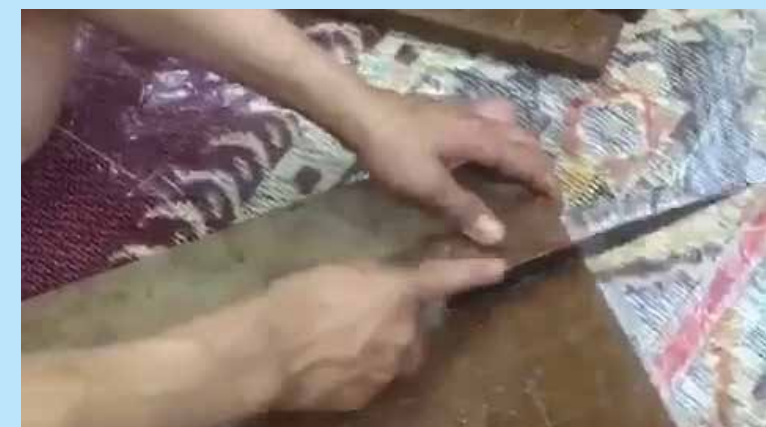
... to make tiger bone glue