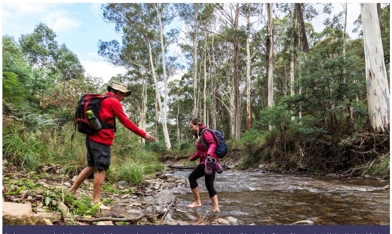
Parks are a natural solution that can help secure human health and well-being; bushwalking in the Ovens River region, Alpine National Park, Victoria

and are a natural solution for securing human health and well-being. Nature can have therapeutic effects for people suffering the effects of social isolation. The mental health benefits derived from time spent in nature will also translate into economic benefits, such as avoided health care costs (Buckley et al., 2019; MacKinnon et al., 2019). In particular, urban parks and protected areas are becoming a lifeline for physical and mental health (Mell, 2020; Surico, 2020); this increased usage and interest could have additional benefits for protected and conserved areas and green space more generally.