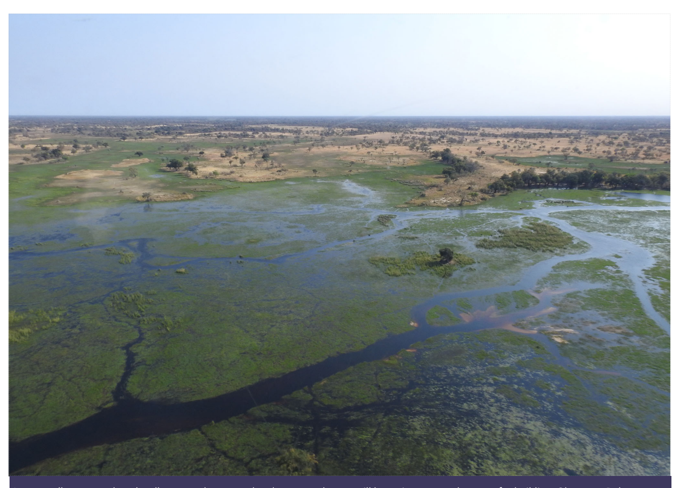
Large, well-connected, and well-managed protected and conserved areas will be an important element of rebuilding; Okavango Delta, Botswana

<u>Restore management capacity</u>: Many protected and conserved areas are critically short of management capacity, and managers now face new challenges.