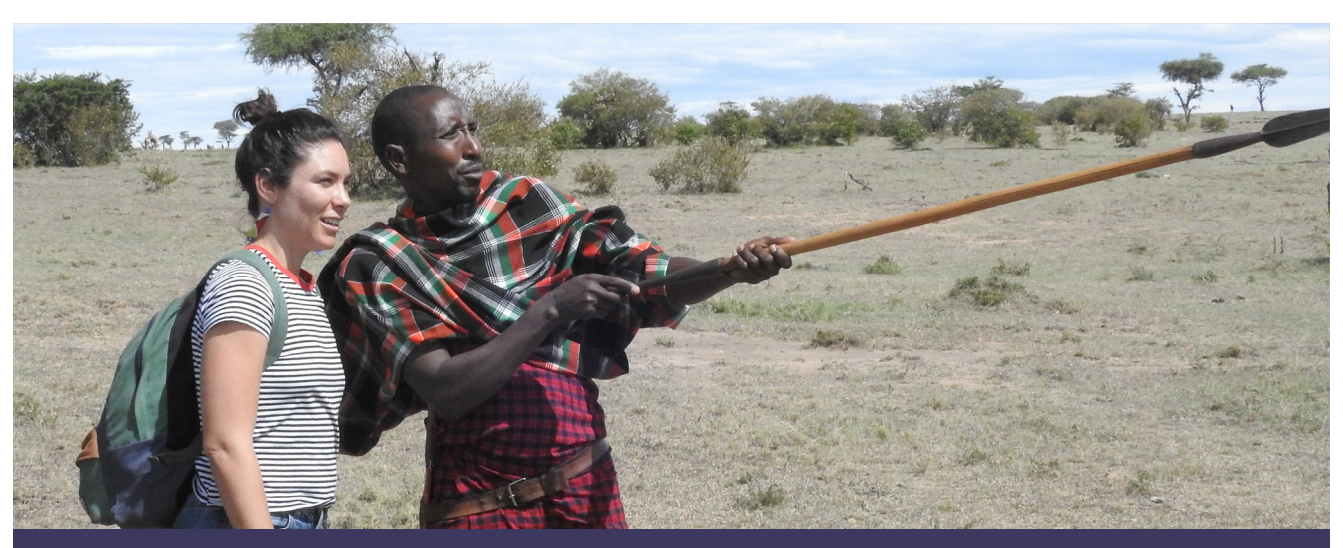
Local community guides earned income by taking tourists on walks through the Mara Naboisho Conservancy — income that has now ceased as a result of the pandemic

Wildlife and nature tourism are major contributors to economic activity around the world. Before the pandemic, researchers estimated that the world's protected areas received roughly eight billion visits per year, generating approximately USD 600 billion per year in direct in-country expenditure and USD 250 billion per year in consumer surplus (Balmford et al., 2015). A 2019 estimate puts the direct value of wildlife tourism at USD 120 billion or USD 346 billion when multiplier effects are accounted for, and it generated 21.8 million jobs (World Travel and Tourism Council, 2019). This income has virtually stopped as a result of COVID-19: a recent survey of African safari tour operators found that over 90 per cent of them had experienced declines of greater than 75 per cent in bookings and many indicated they had no bookings at all, thus affecting local employment<sup>3</sup>. With more than 16 million people directly or indirectly employed in tourism within the African region, the impact is immense. Community-based conservation areas in particular provide income support for families through a share in tourism-derived income. The Mara Naboisho Conservancy in Kenva, for example, provided the main cash income for over 600 Maasai families; this has now disappeared with the cessation of tourism4.