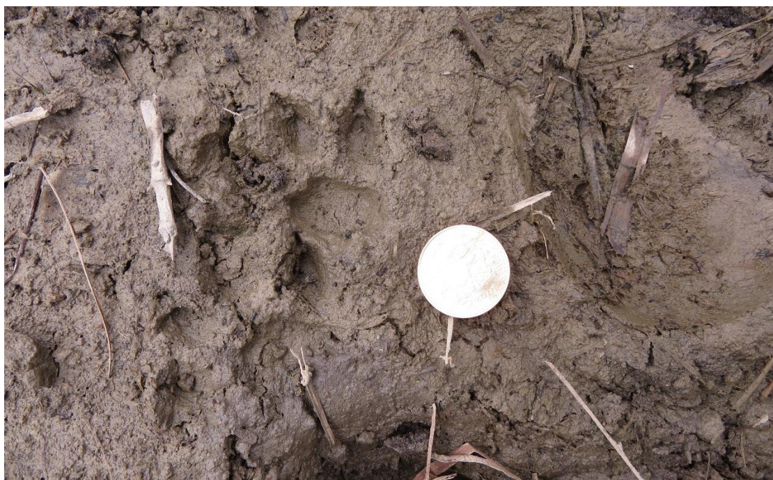
Fig: A tiger footprint recorded during the field visit (Pad Width > 7cm, Index coin diameter 2.5cm) (A), footprint of possible fishing cat recorded near Halkhoriya Daha (B).