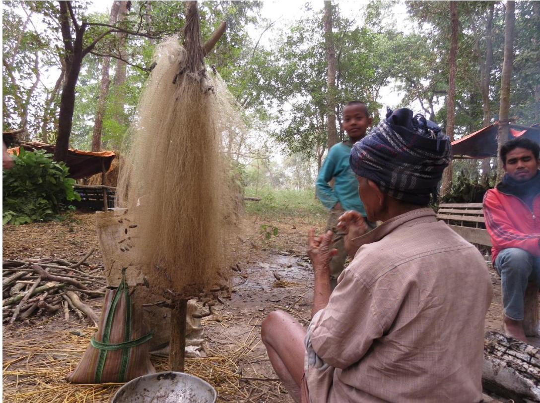
Figs: People often go to the forested areas for logging (A), firewood and fodder collection (B, C), fishing in the Halkhoriya Daha (D). People also make temporary camps/shelter inside the forest certain times of a year eg for fishing and logging (E).

Progress has been made towards establishment of Community Based Anti-poaching Units (CBAPUs) in Bara-Parsa Complex. These CBAPUs will comprise several community level anti-poaching units. A total of 13 community anti-poaching units is identified. On the wake of recent earthquake in Nepal, the proposed activities for mobilisation of CBAPUs in Bara-Parsa Complex has been delayed. Prior to the earthquake, meetings were held with the Department of National Parks and Wildlife Conservation in Kathmandu and as well with the Chief Warden and protection unit in Parsa Wildlife Reserve regarding the formation and mobilisation of CBAPUs. During the meetings, Chief Warden had requested to support 13 units in the Bara-Parsa complex. These units need resource support and technical assistance for continuing their operation. Request has been filed to the DNPWC for the formation of new CBAPUs in close community of Bara forest.