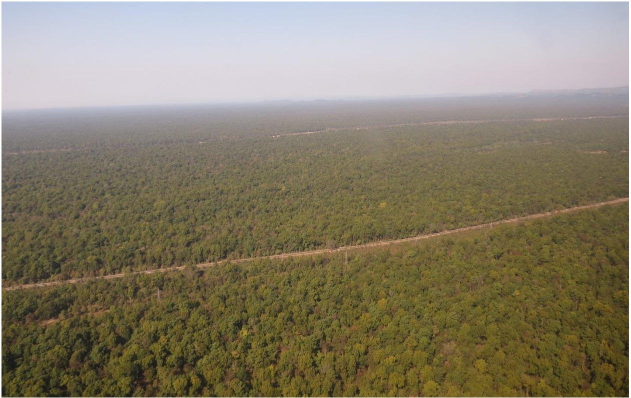
An aerial view of Parsa-Bara forest complex