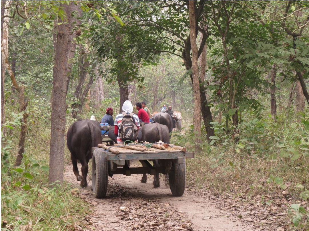
Loggers use buffalo cart to transport the timber.