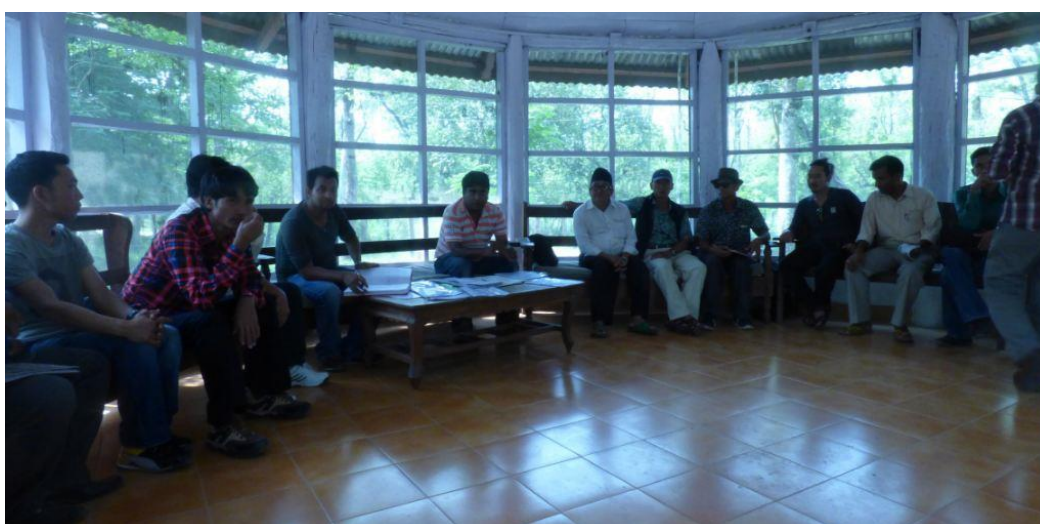
Figs: Meetings of the CBAPU members with the Chief Warden of Parsa Wildlife Reserve at the Reserve Headquarter.