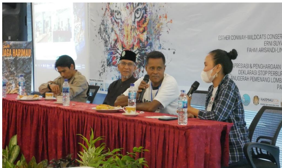
Speakers in the Webinar

This activity will be held in July 2022 in conjunction with the celebration of Global Tiger Day. This activity was also attended by more than 100 participants (Offline and Online) and presented 20 ex-hunters who had been trained by Lingkar through the guardianship program. At the end of this webinar, 20 ex-hunters also publicly declared to stop hunting activities and then they will be actively involved in securing forest areas in their respective territories from illegal activities, as a form of their commitment to stop hunting before activities. In the webinar, they have submitted their traditional hunting gear, such as wire snares and homemade firearms, to the Kerinci Seblat National Park Authority.