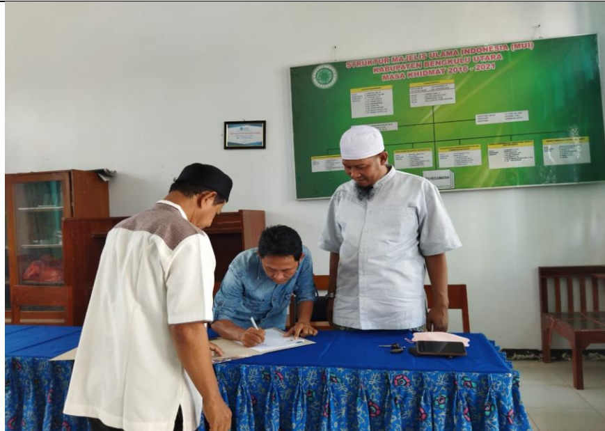
Signing of the extension of the MoU between LINGKAR INISIATIF INDONESIA and MUI North Bengkulu