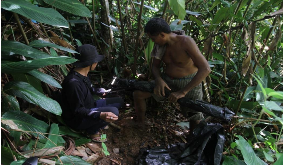
Ex-hunter (Mawi) handed over a firearm that was usually used for hunting and stored by being buried in the forest