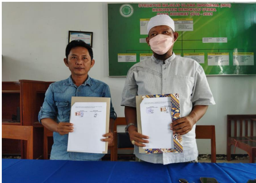
Signing of the extension of the MoU between LINGKAR INISIATIF INDONESIA and MUI North Bengkulu