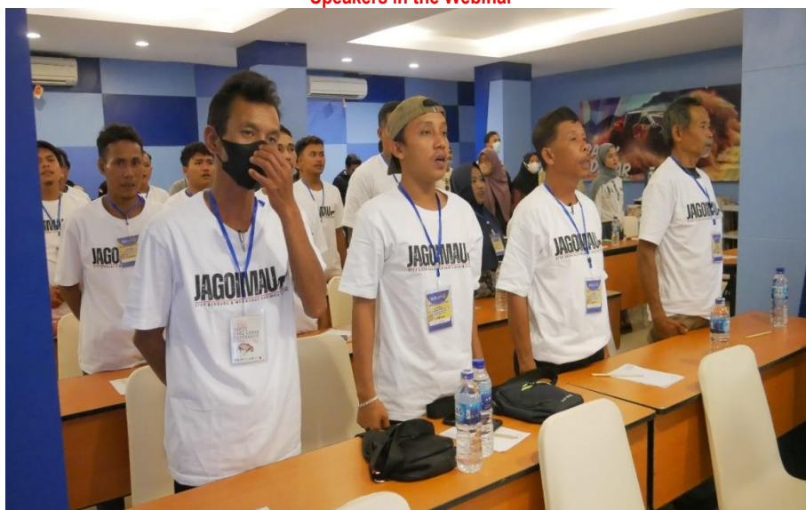
Webinar Activity Participants (ex-hunters)