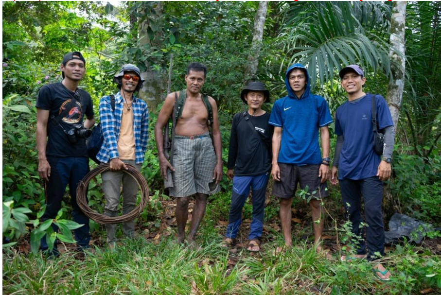
Handed of homemade firearms and snares