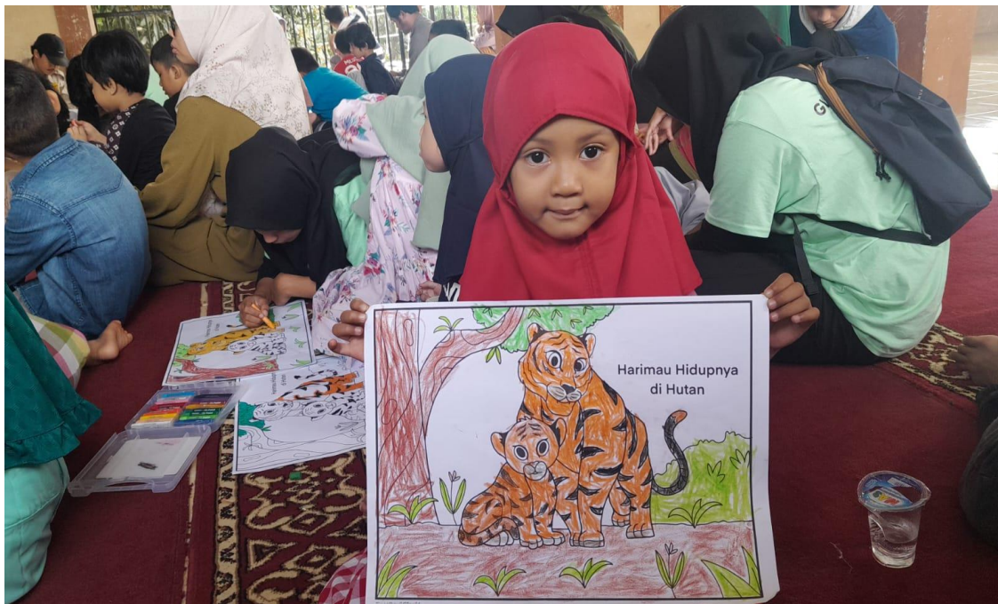
Conservation Education for Elementary School Children