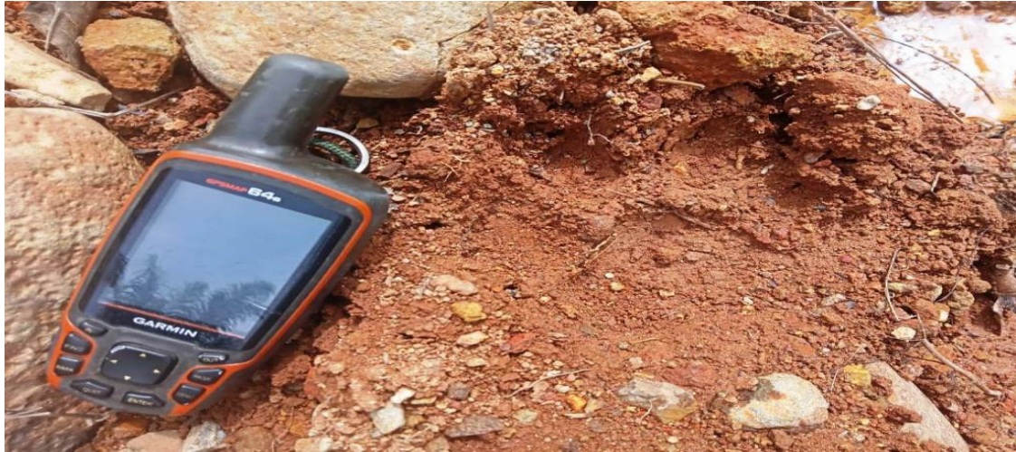
Sumatran Tiger Footprints