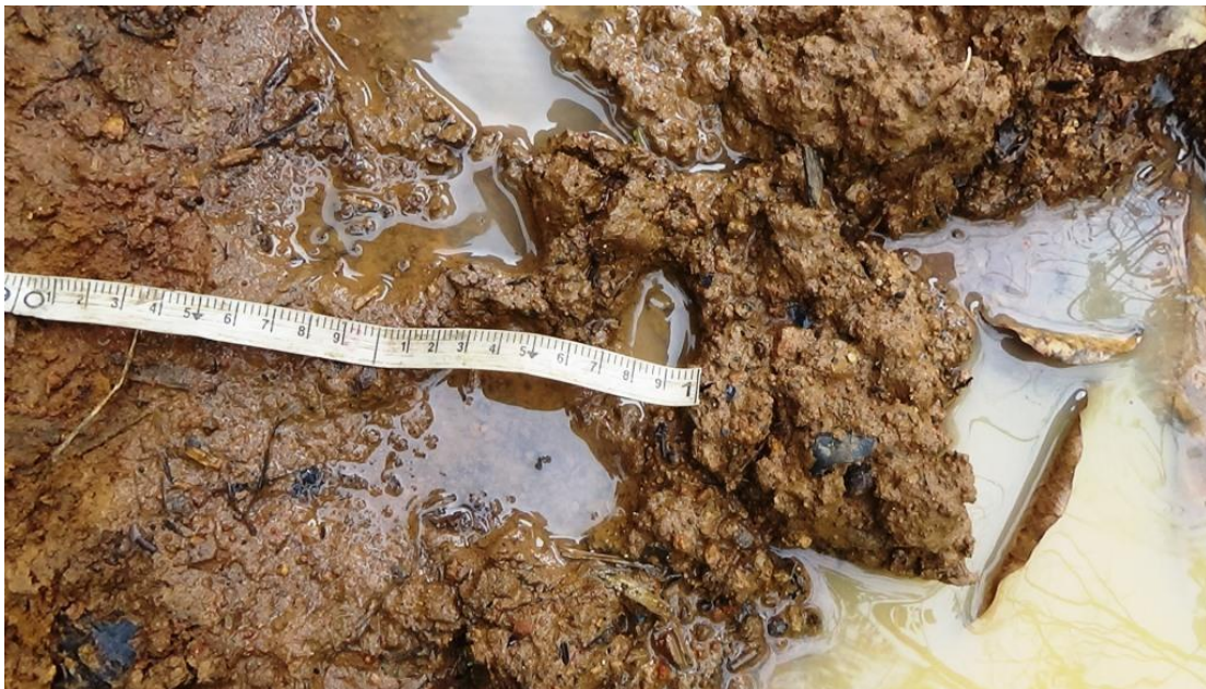
Tiger Footprints in Conflict Location