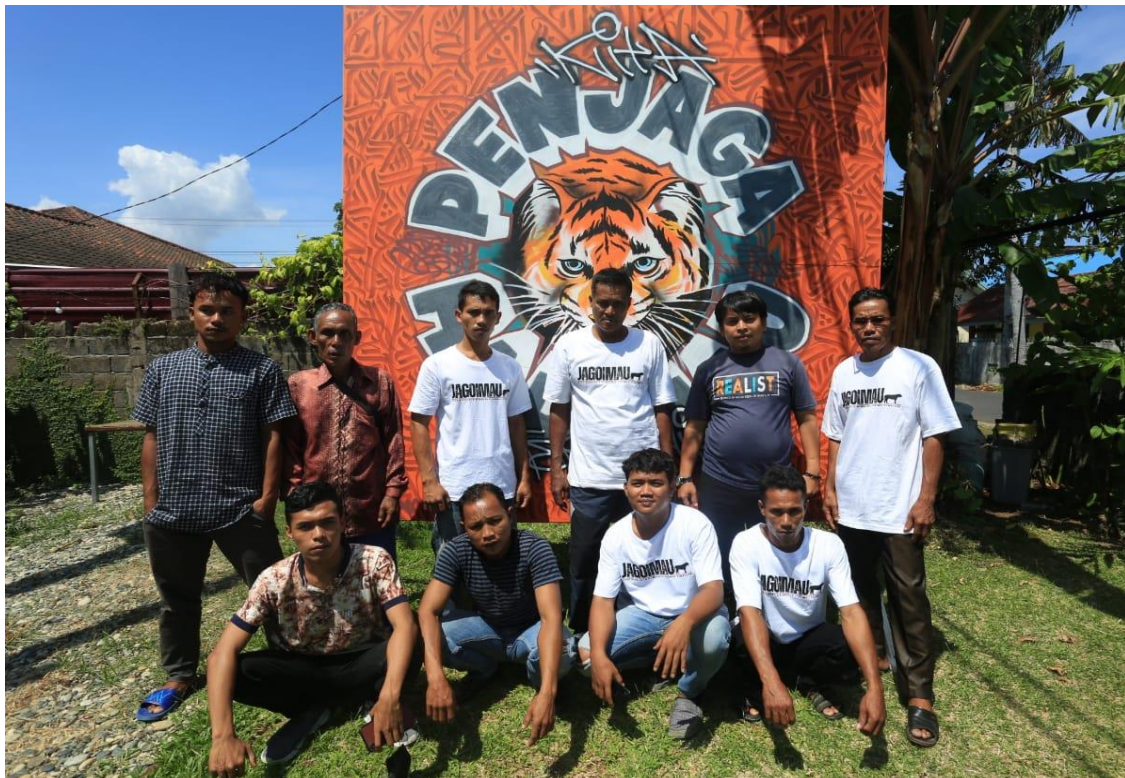
Establishment of a conservation partnership group "JAGO IMAU"