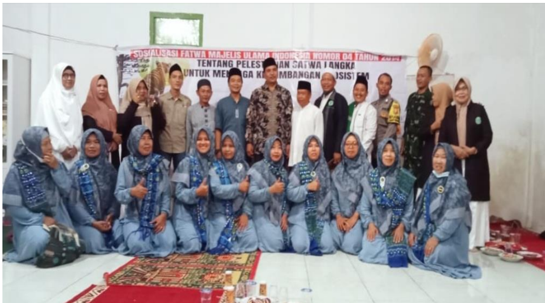
Socialization of the Fatwa of the Indonesia Islamic Scholars Council (MUI) No. 04 of 2014 concerning the Prohibition of Hunting and Trading of Protected Wildlife

During the period February-July 2023, the Lingkar Inisiatif Indonesia has held regular meetings with the Indonesia Islamic Scholars Council (MUI) 2 times. This regular meeting has determined the plan and evaluation of socialization activities and identified the need for socialization activities in the next 6 month period (August 2023-January 2024).