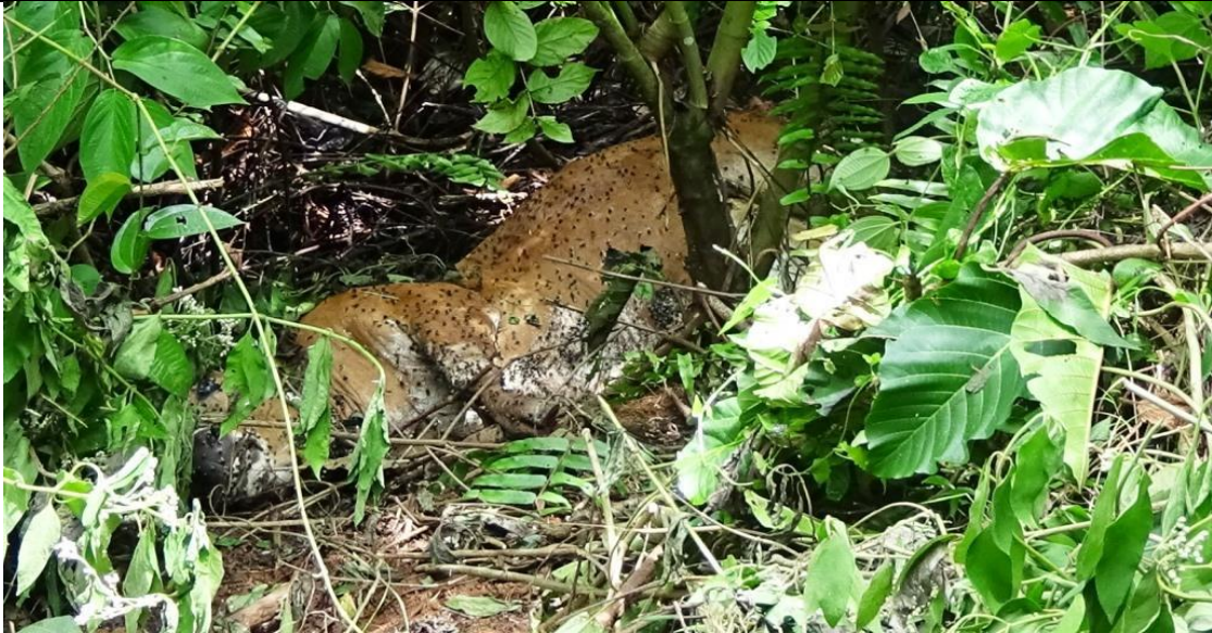
A resident's cow was eaten by a tiger