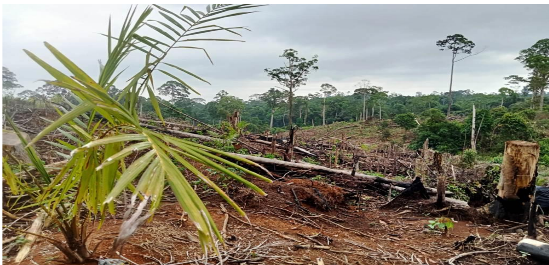
Patrol Team Findings: Evidence of illegal clearing of plantation land