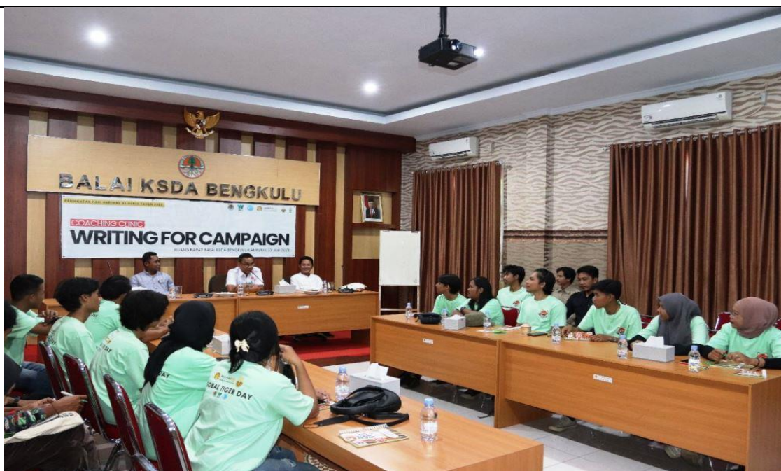
Writing Training and Media Campaign for Young Conservation Cadres in Bengkulu Province

In general, during the first six months of the February-July 2023 period, we encountered no obstacles, the overall program was able to run well, although there were several implementation activities behind the originally planned schedule, such as the signing of the Cooperation Agreement (PKS) between the Kerinci Seblat National Park Center with the Conservation Partnership Group and the signing of the Conservation Cooperation Agreement (PKS) Extension of the MoU between the Lingkar Inisiatif Indonesia and the National Park Office, which will only be implemented at the end of October 2023. In the second six month period of project implementation, we have received confirmation of certainty of funding support from partners (Auckland Zoo) to support project activities until the period of August 2024.