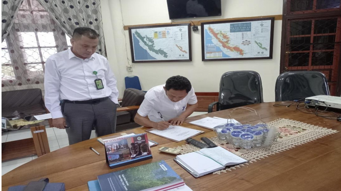
The signing of the LINGKAR INISIATIF INDONESIA Annual Work Plan (RKT) with the Head of Kerinci Seblat National Park

The schedule that had been planned for August could not be implemented because in August-September the National Park Authority was appointed by the government as the implementing committee for National Scout Day commemoration and was focusing on preparing these activities. From our discussion with the Head of the National Park Center, the signing of the Cooperation Agreement (PKS) between the Kerinci Seblat National Park Center and the Conservation Partnership Group and the signing of the Conservation Cooperation Agreement (PKS) The extension of the MoU between the Lingkar Inisiatif Indonesia and the National Park Center will be carried out at the end in October 2023.