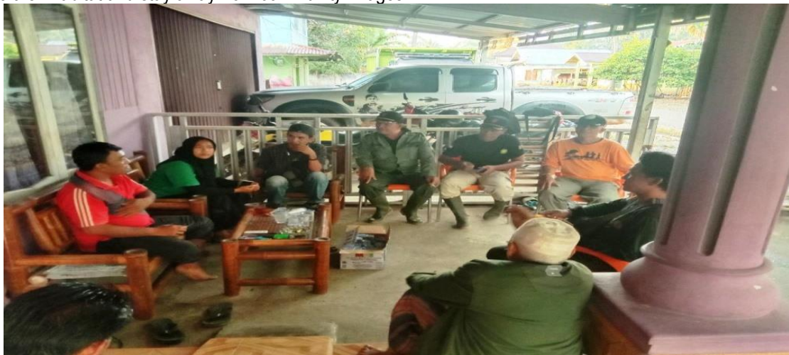
Conflict Handling Team Coordination Meeting with the Village Head of UPT Lubuk Talang Translapindo

During the period February-July 2023, the Lingkar Team has made 1 responses to handling conflicts between humans and protected wildlife in Lubuk Talang UPT Translapindo Village, Muko-Muko Regency, Bengkulu Province. The community has suffered the loss of 3 cow which was eaten by the tiger. The handling was carried out with a team from the Bengkulu Unit for Conservation of Natural Resources (KSDA) and Kerinci Seblat National Park Authority by eviction using traditional cannons so that the tigers could return to their habitat and stay away from community villages.