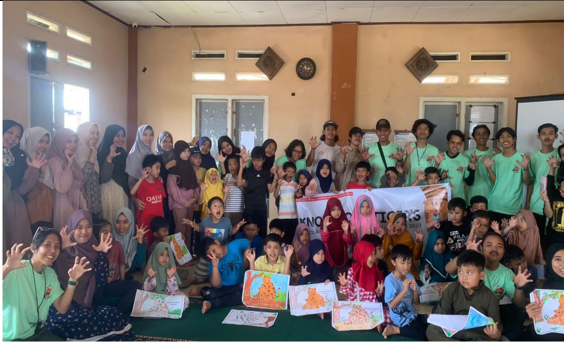
Conservation Education for Elementary School Children