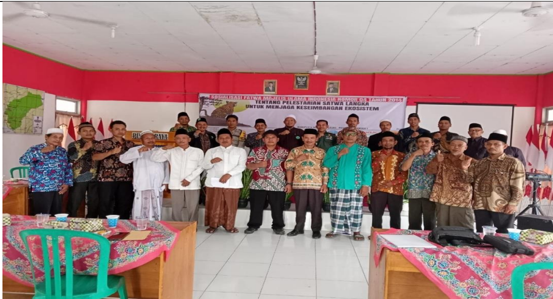
Socialization of the Fatwa of the Indonesia Islamic Scholars Council (MUI) No. 04 of 2014 concerning the Prohibition of Hunting and Trading of Protected Wildlife