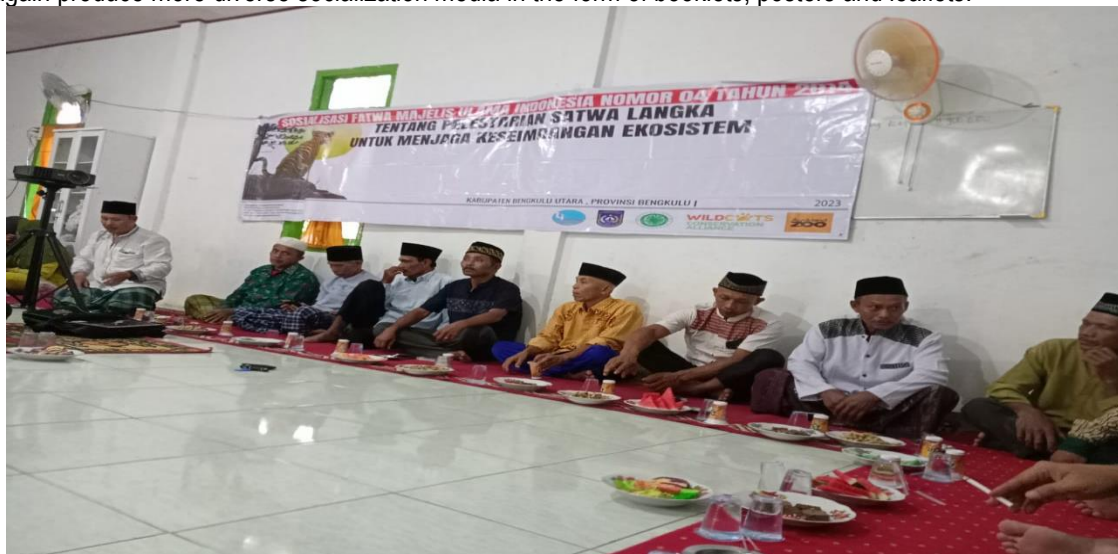
Socialization of the Fatwa of the Indonesia Islamic Scholars Council (MUI) No. 04 of 2014 concerning the Prohibition of Hunting and Trading of Protected Wildlife

During the period February-July 2023, Socialization of FATWA of the Indonesia Islamic Scholars Council (MUI) Number 04 of 2014 concerning the Prohibition of Hunting for Protected Wildlife has been carried out 3 times consisting of: in Renah Jaya, Sumber Mulya, and Kurotidur Villages, North Bengkulu Regency with a total of There were 219 socialization participants. From the 3 socialization activities, it was identified that the future need was a medium for introducing protected wildlife species because most of the socialization participants did not know the development of protected wildlife species under the Conservation Law in Indonesia. In the future, the Lingkar Inisiatif Indonesia Team and the Indonesian Ulema Council (MUI) will again produce more diverse socialization media in the form of booklets, posters and leaflets.