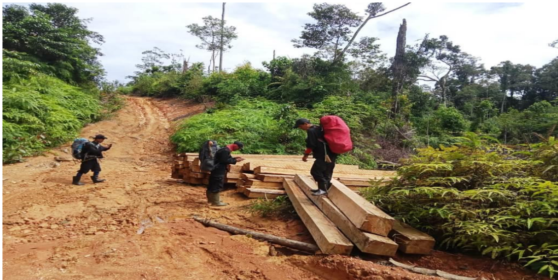
Patrol Team Findings: Evidence of Illegal Logging in Forest Areas