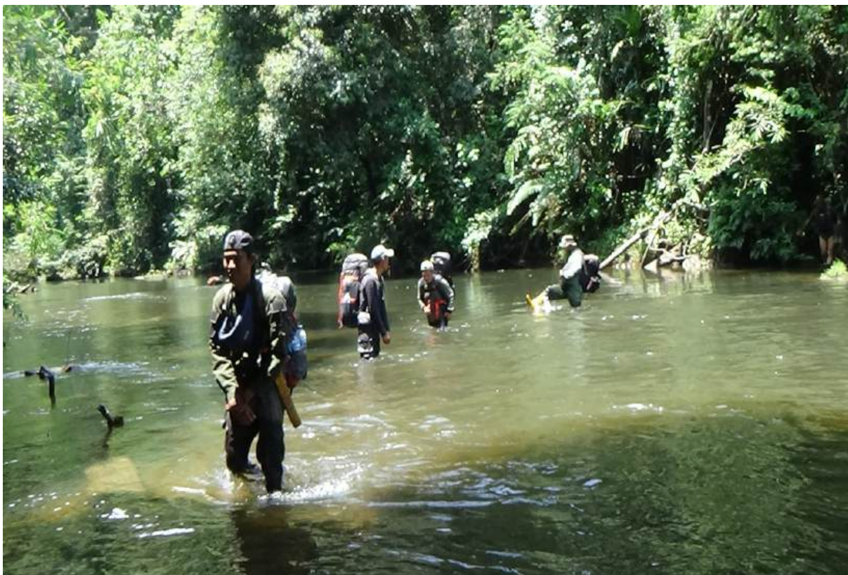
Lingkar Inisiatif Indonesia Patrol Team