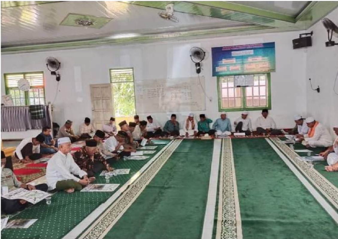
Socialization of Fatwa MUI in Tebing Kaning Village, North Bengkulu Regency