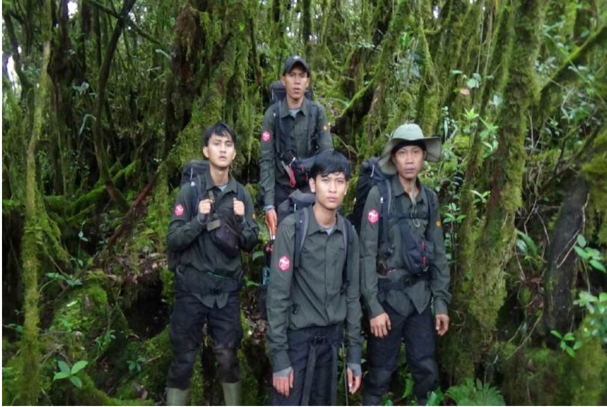
Lingkar Inisiatif Indonesia Patrol Team