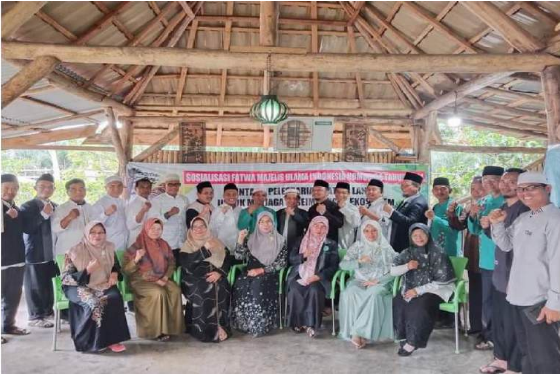
Socialization of MUI FATWA in Air Napal Village, North Bengkulu Regency