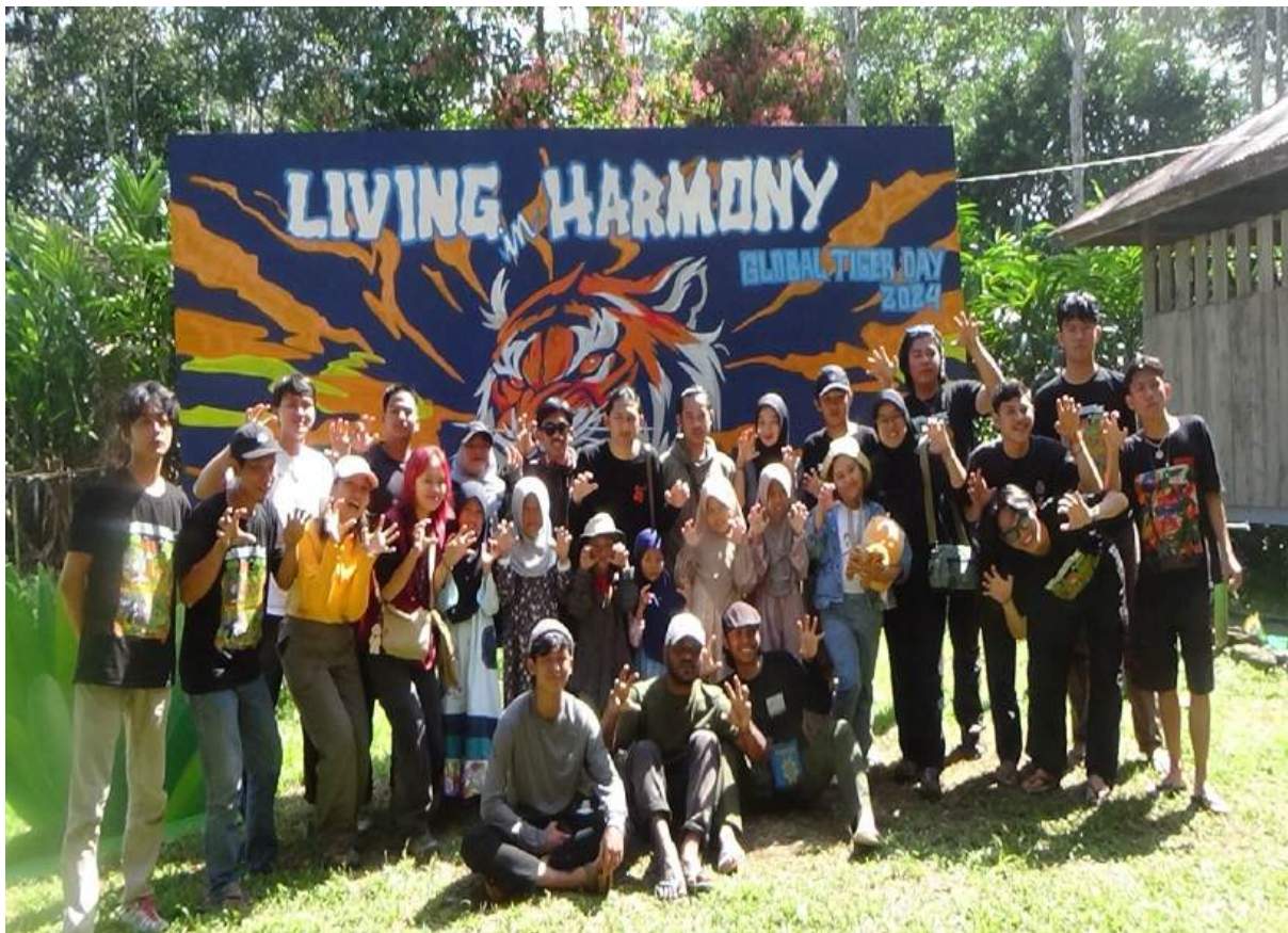
Participants and Committee of Public Speaking Competition for Elementary School Children

WildCats Conservation Alliance is a wild tiger and Amur leopard conservation initiative between Dreamworld Wildlife Foundation and the Zoological Society of London, (UK charity# 208728).