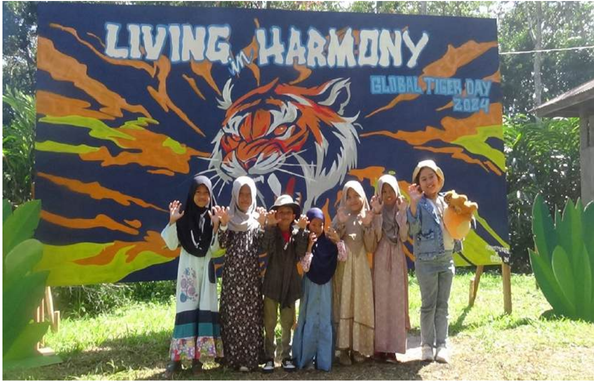
Public Speaking Competition Winners for Elementary School Children