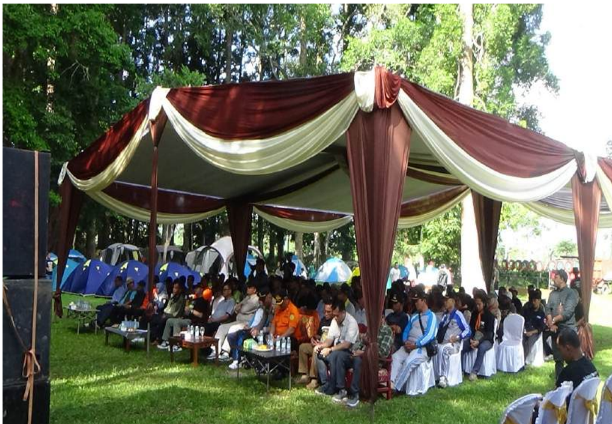
Participants of the 2024 World Tiger Day Commemoration Talkshow