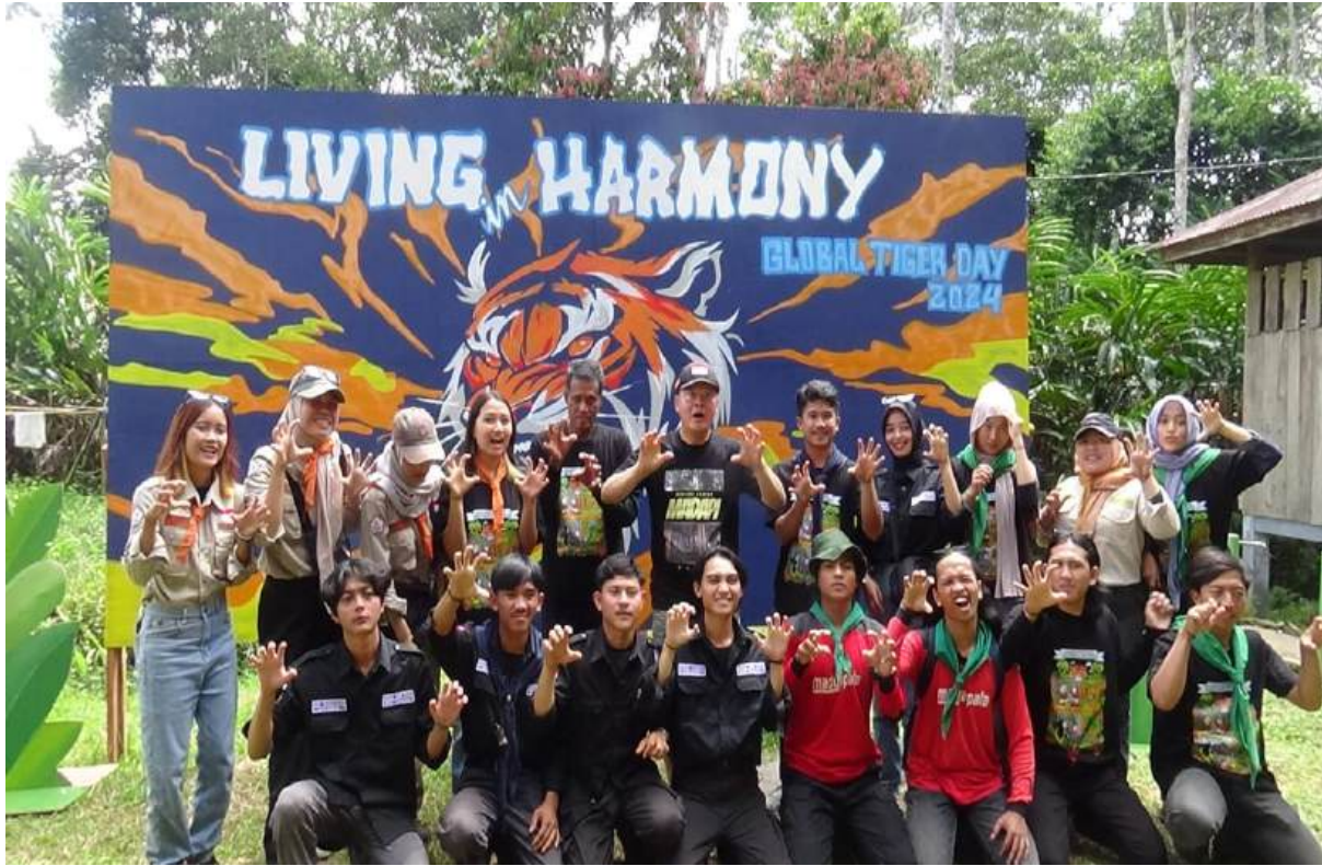
Governor of Bengkulu together with participants of the Conservation School in the Commemoration of World Tiger Day