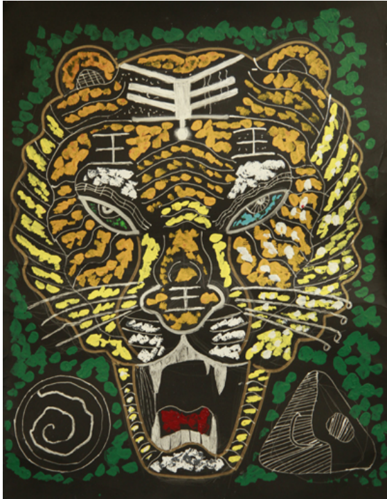
“Tiger” by Zhang Aixi from Kunming No.12 High School

Over two months, 33 primary schools participated in AAW 2010 from Lanzhou, the capital of Gansu Province. AAW volunteers from nine university green groups went into schools and held more than 100 classroom activities. Both students and teachers enjoyed the campus exhibitions and lectures.