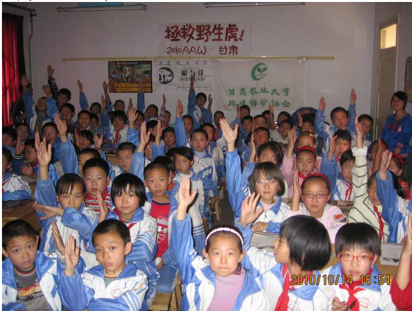
Lanzhou Kongjiaya Second Primary School

Over two months, 33 primary schools participated in AAW 2010 from Lanzhou, the capital of Gansu Province. AAW volunteers from nine university green groups went into schools and held more than 100 classroom activities. Both students and teachers enjoyed the campus exhibitions and lectures.