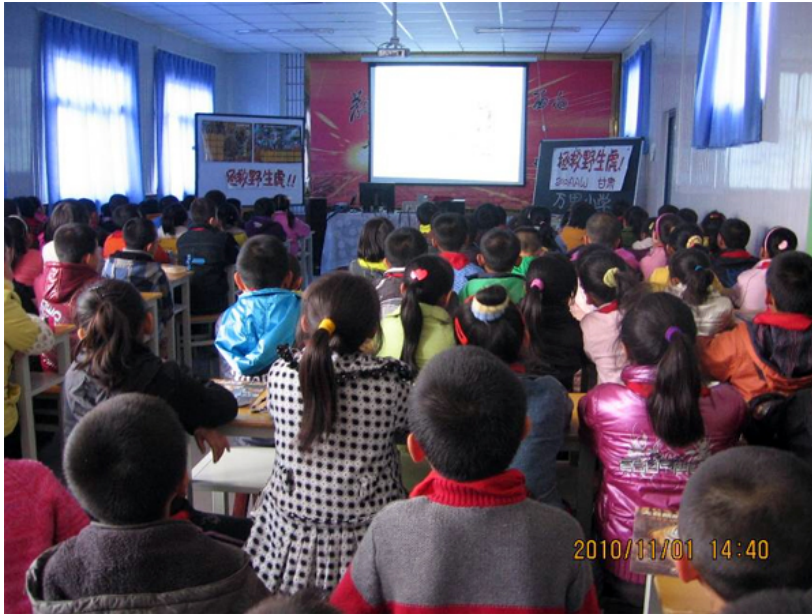
Lanzhou Wanli Primary School