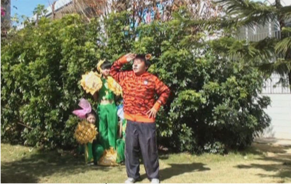
“Happy Melody” by The 4 th Middle School of Simao, Yunnan