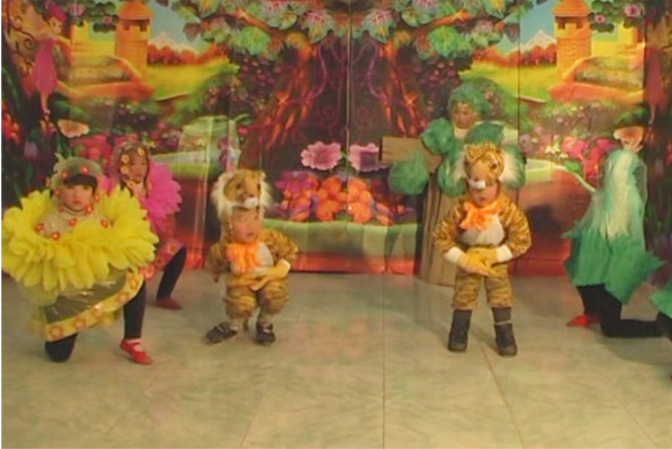
“Tigers learning skills” by Wuhan Daxinglu Kindergarten