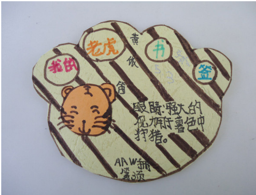
Tiger book marks made by students from Tianjin Hexi Central Primary School