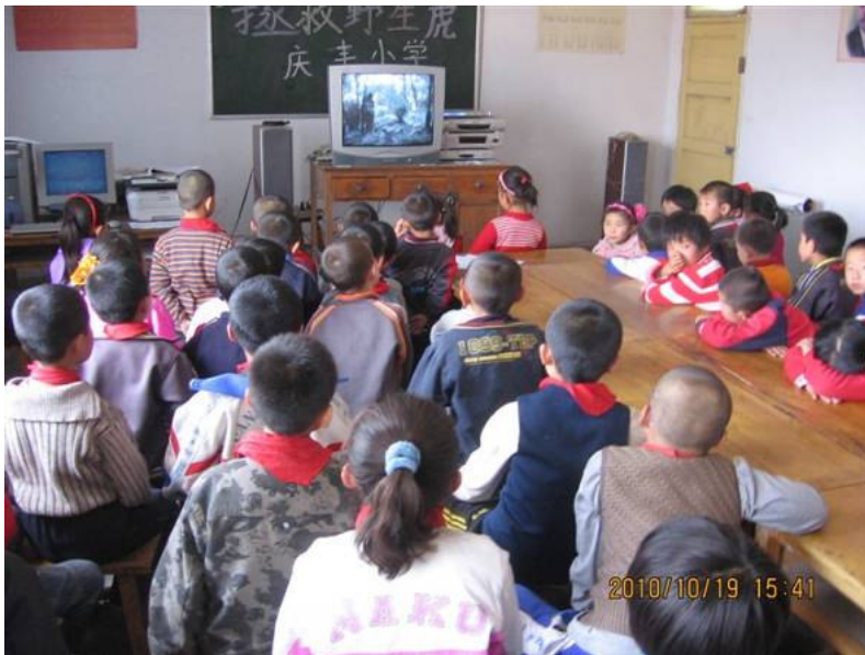
Students from Qingfeng Primary School watch AAW video