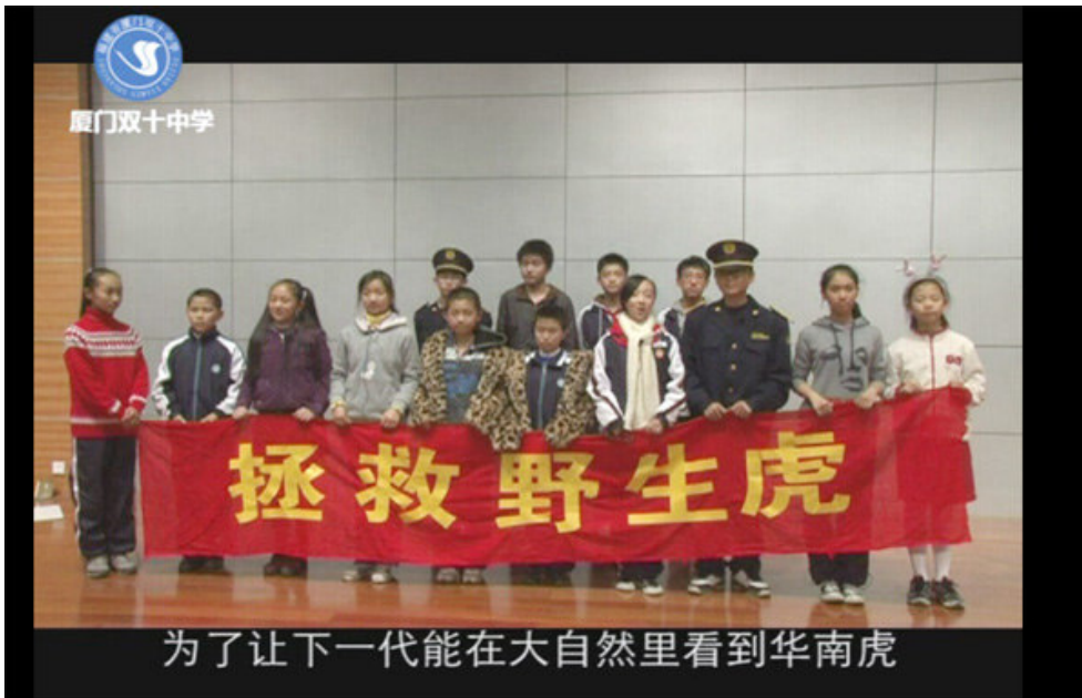
“Hope” by Xiamen Shuangshi Middle School