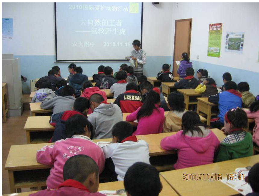
Students from Primary School affiliated with Gansu Agricultural University participating in AAW activities.