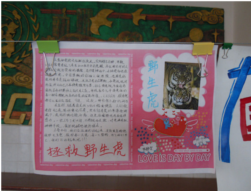
“Save the Wild Tiger” posters made by students from Xiamen No.1 Middle school