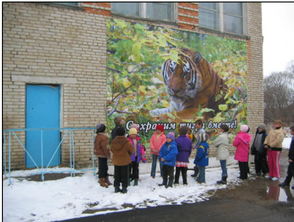
Children look at a tiger board Lukyanovka village, Krasnoarmeisky district

A tiger conservation banner was hung on school in Roshino village. Apropos of this event there was a school meeting where the head of the village stated the importance of the project. After that the students went cleaning the village. A litter pick was organized on the territory adjacent to the school where the eco-center is located. The most active visitors of the center took part in it. A week later they planted flowers and trees near the school. Twenty-four students assisted.