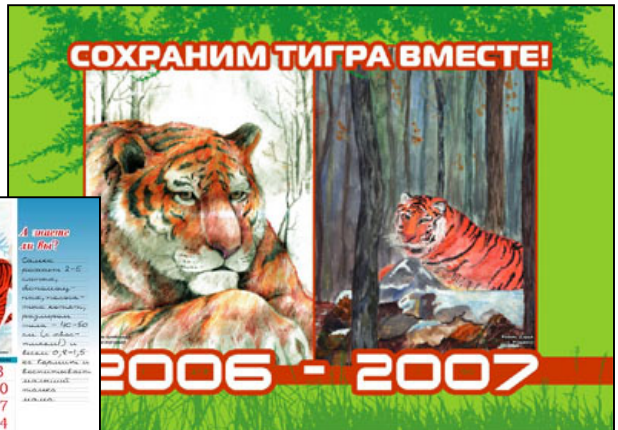
Front cover (background) and one page of a calendar with children's paintings

In September 2005 the Phoenix Fund announced that all schoolchildren in the north of Primorye were invited to take part in art contests devoted to Amur tigers and their conservation. The contests were carried out at the target schools in the Northern Primorye. As a result, Phoenix received 167 tiger paintings from Terneisky, Krasnoarmeisky and Pozharsky districts. It was very hard to choose the best young artists. Though Phoenix chose 17 paintings for the calendar to be published and distributed in the areas with the targeted schools.