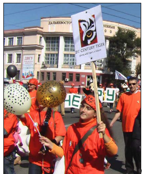
Festive parade in Vladivostok

preliminary contests and choose the winners, etc. The Committee members are representatives of the local and international non-governmental conservation organizations such as Phoenix, WWF-Russia, and Far Eastern fund of culture support «AzArt», active schoolteachers and volunteers. For the reported period the Committee held three meetings that