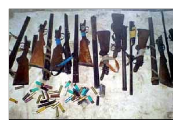
Seized illegal firearms

September On 01, while patrolling Dalnerechensky district the Western wildlife managers' team arrested two logging teams (14 people of Vedenka village and Dalnerechensk city) for illegal logging 20 km far from Vedenka village. The team seized three "Husqvarna" chainsaws, three DT-75 tractors and five "Kenwood" radio stations. The total damage of felled trees (oak, linden, ash tree) was 1,200,000 roubles ($47,060). Criminal proceedings initiated on the case.