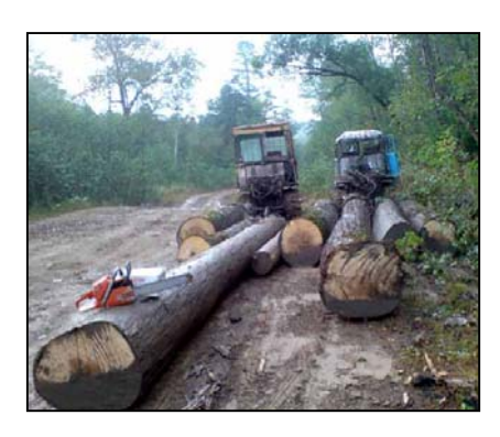
Final report January - December 2007