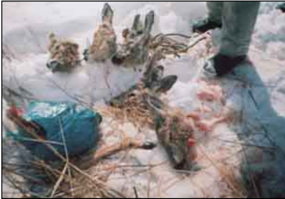
Confiscated roe deer heads

On April 13, while patrolling hunting grounds of Khorolsky hunting and fishing society, the team arrested two men for illegal presence with rifles in protection zone of state nature reserve at 8 p.m. The violators paid a fine.