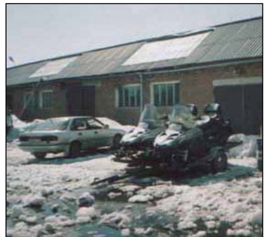
Confiscated snow mobiles

Bikin river in Pozharsky district. In the neighborhood of Krasny Yar village they stopped Mr. Saronov who fished with nets during spawning season. They confiscated the nets and made up a report on the man.