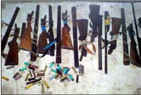
Seized illegal firearms

On September 23, the wildlife managers stopped a jeep near the Dikarka stream in the hunting grounds of Krasnoarmeisky district. The jeep's owner turned out to be a local of Glubinnoye village. He had a rifle IZH-27, 12-gauge without a license and a permit to hunt. The wildlife managers drew up a report on administrative violation, seized the rifle and handed it over to Krasnoarmeisky police office for further investigation.