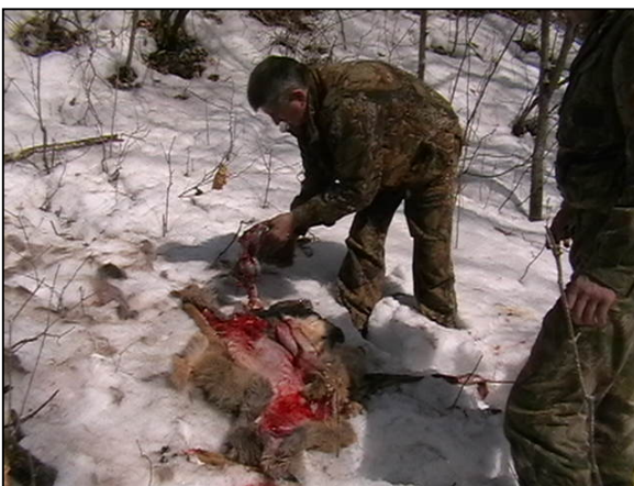
Wildlife managers found poached deer