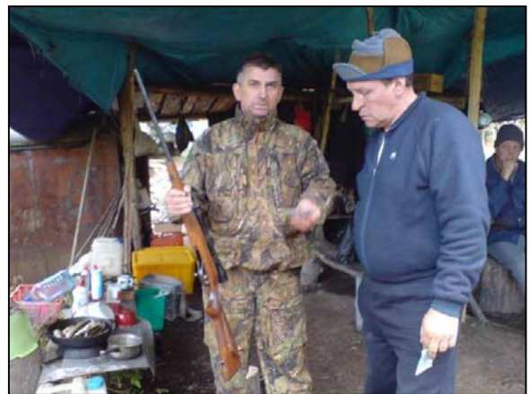
Team leader checks a gun license

On October 16, a local of Boguslavets village with a rifle was arrested 15 km far from Limonniki village. His gun license was overdue. The violator was charged with an administrative violation. On the same day, while patrolling the hunting grounds of Pozharsky district, the team detained three men for illegal hunting. The men were hunting during closed hunting season and killed 10 squirrels and two hazel grouse. Two illegal rifles were seized and forwarded to a local police office. The wildlife managers drew up a report on violations of hunting regulations on each poacher.