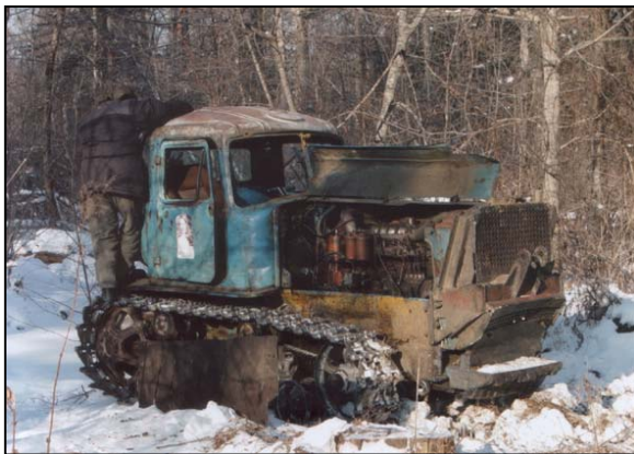
Wildlife managers found an abandoned tractor

On January 30, the team patrolled hunting grounds of Dalnerechensky district 14 km far from Zimniki village and found a 16-