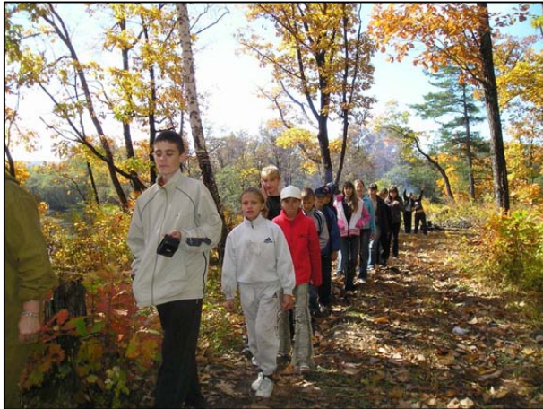
Excursion to the forest

the environment that is caused by the waste that stay decomposed for many years, but also learned in practice how to press empty tetra pack cartons and plastic bottles to minimize the damage to the environment. During the lessons children also talked about food waste. They not only observed how animals, living in the pet's corner of "Flowerspring" eco-centre, were eating watermelon peels, but also learned about Californian worm - a specific species of earth worms that can quickly process domestic waste into humus.