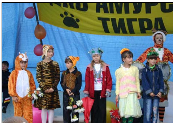
Tiger Day Festival in Luchegorsk city

As usual, a month prior to the Festival a