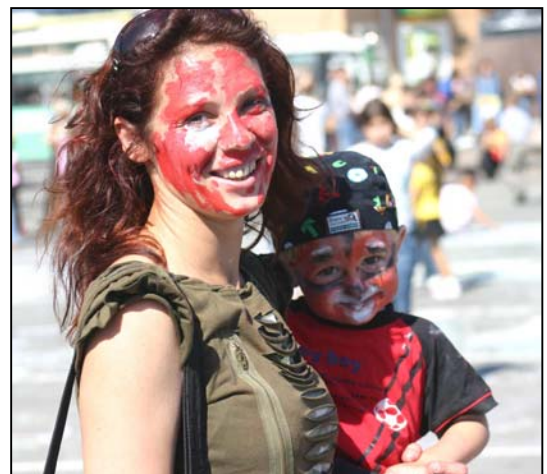
Happy “tiger” family

Young residents of Vladivostok were drawing tigers of various sizes and shapes on the city's central square. In 2004 over 180 children took part in the tiger face painting contest and over 150 in tiger paintings on asphalt contest during the Tiger Day Festival in Vladivostok. In 2005 there were twice as many children and their parents that participated in the contests with great pleasure.