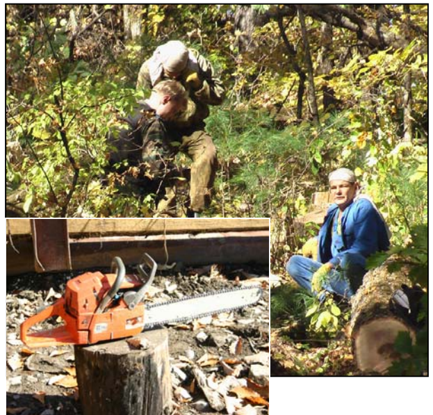
Arrested illegal logger (background) and confiscated chain saw (foreground)

was carried out by 7 men. During examination of the site the team found tractor, car, crane, chain-saw, rifles and bullets. A closer examination of the car revealed that last figure