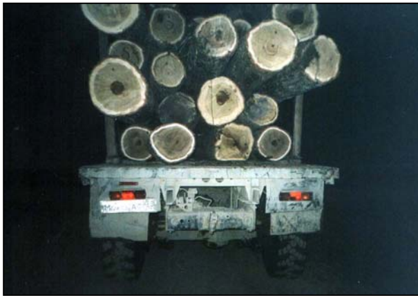
Arrested vehicle with illegal wood

oaks. On the place of illegal logging the team found a tractor DT-75. A criminal procedure was initiated on the case.