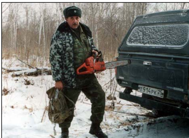
Ranger with confiscated chainsaw

On October 13, 2005 on the main road Dalnerechensk – Nakhodka within one kilometre (0.6 mile) from LDK village the rangers stopped two vehicles –Ural truck and GAZ-53 jeep loaded with timber in the assortment of 24 items. The drivers did not have any accompanying documents. They explained to the rangers that an unknown man had asked them to transport the timber to LDK village, because his own car had broken. The officers wrote a report to the head of the police department of Dalneretchensk City. The detained vehicles and the drivers were brought to the Department for Economic Crimes of Dalnerechensk City. Later on, it became known that the driver of the jeep is a former policeman with 20 years of service.