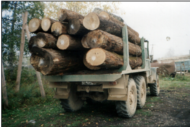
® Phoenix Fund

On September 08 near the Namov spring the team stopped “Nissan safari” vehicle with three passengers. As a result of checking the jeep the wildlife managers found a hand-made rifle, drew up a report on violations of hunting regulations and initiated criminal proceedings.