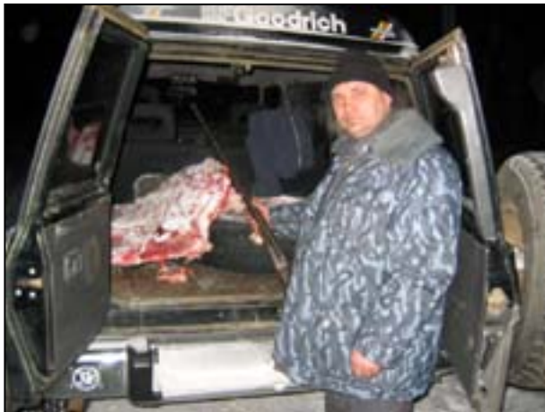
Police officer found poached meat

On February 13, the joint team was patrolling near the Perevalny stream when the rangers found two rifles hidden in a hollow tree. Unfortunately, the owners could not be determined. The rifles were handed over to the police department.