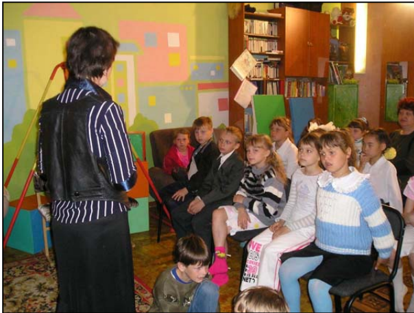
Lecture "Animals of our forests"

On December 07, a lecture "Animals of our forests" was given for 27 children at school No. 1 of Luchegorsk city. The pupils learned about the unique fauna of Primorye and threats for the species survival. The children watched colourful posters of the endangered Amur tiger and Far Eastern leopard. Nowadays southern Primorye is the only habitat of highly endangered leopard. At the end of the lesson the pupils watched "Tiger Odyssey" movie.