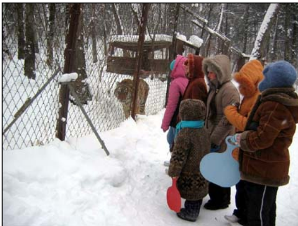
Utyos rehabilitation centre

The educator carried out a lesson "Tiger arithmetic" in the form of a slide presentation. She told about tiger lifetime based on a story from "Amur tiger: kids' book" showing illustrations from the book through the projector. The pupils discussed the reasons for death of tiger cubs, talked about the difference between hunters and poachers, and learnt the size, weight and other characteristics of the tiger. At the end of the lesson the teacher asked questions to test how the children learnt new material. The pupils who gave correct answers were awarded with "Amur tiger" book. The same lessons were conducted in a secondary school of Izmailikha village situated 70 km (43 miles) far from Novopokrovka town. Only 100 pupils study at that school.