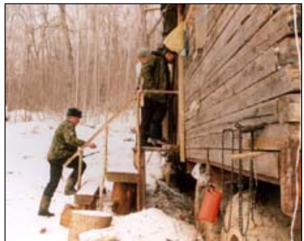
The team is checking a winter house

In 2005 two public environmental investigation teams continued anti-poaching activities in the north of Primorye. From January 01 through December 31, 2005 public rangers in cooperation with wildlife managers, police officers, forest service staff and Inspection Tiger rangers conducted over 100 patrols in Pozharsky, Krasnoarmeisky and Dalnerechensky districts of Primorye. The raids were focused on conservation of the ungulates habitat as hunting was allowed only during the first month of the year. March and April are the months of a thawing season that leads to occurrence of thin crust of ice on the ground, and as a result, animals often hurt their legs and cannot elude pursuit by dogs and poachers. All patrols were documented and recorded on video camera. For the reported period the team drew up 92 reports on violations of hunting regulations, confiscated 69 illegal rifles, 11 traps and other poaching devices and poached wildlife (see Table 1 in the Attachment).