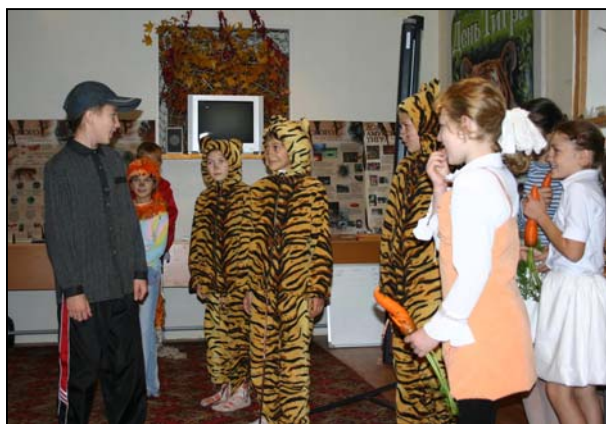
Play “Visiting Primorye”

On July 13 the children listened to the story about tiger cubs. Next day after watching a cartoon they looked through the photos of live and dead tigers. The children shared their impressions and promised never to kill animals.