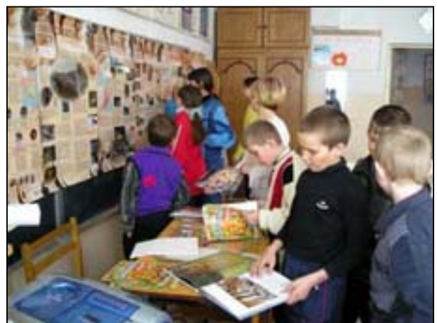
Eco-class on Amur tiger

In January 2005 the educator in Pozharsky district developed a lesson "Ussury taiga" on the basis of the Russian movie with the same name that was filmed in 1979. During discussion of the movie, children compared the nature in those days with the one that we have in our days. For example, children were surprised to see how much fish there had