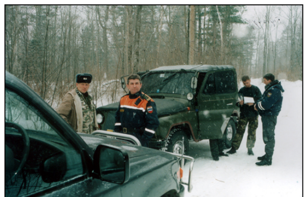
Joint patrol

On March 13, three men were arrested for illegal logging near Kholodny spring 8 km far from Zimniki village. The violators fell 8 oaks and 4 ash-tree. The wildlife managers drew up the report and handed over all materials to the local police department to initiate criminal proceedings.