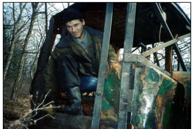
Arrested illegal logger

On November 04 in the hunting lease of Krasnoarmeisky district near Roschino village the rangers arrested two residents of Novopokrovka town with rifles. The violators did not have hunting permits and documents for their rifles. The guns were confiscated and a report on administrative violation was drawn up.