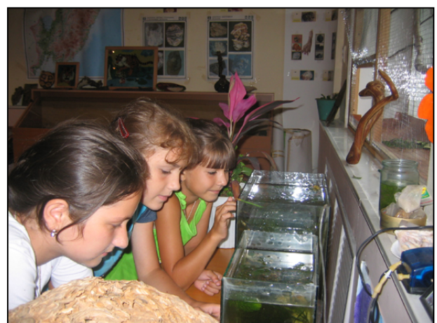
Children are feeding aquarian fish

On April 11, the educator conducted a class on lichen, the plants – sphinx. Children learned the basic information on lichen and how to