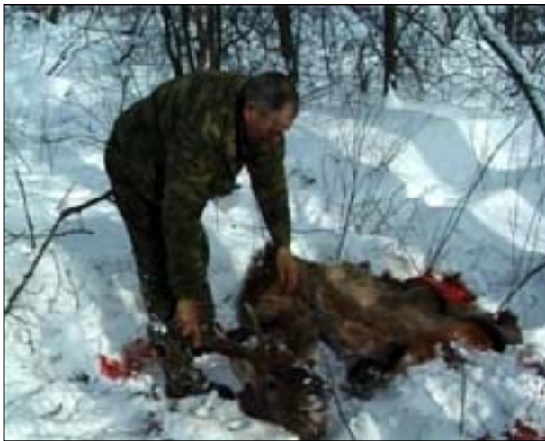
Rangers found poached meat during patrol in Verkhnebikinsky wildlife refuge

tractor. It was impossible to detain the loggers and catch up with the vehicle in the forest. A “sentry” must have worked well. The logs were confiscated.