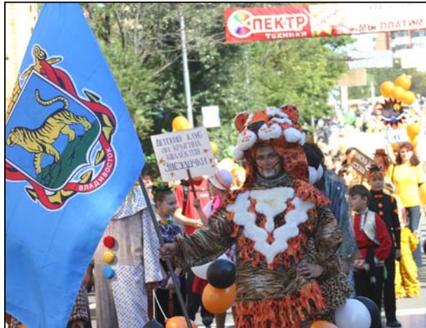
Amur tiger heads the carnival procession in Vladivostok, September 25, 2005

Celebration of the Tiger Day Festival is a wonderful tradition in Vladivostok, Russian Far East. The Festival reminds people about the uniqueness and beauty of the territory they live in. Amur tiger is a symbol of Vladivostok city and Primorsky krai, the animal most respected in the Russian Far East. One of the central Vladivostok streets is called “Tigrovaya” in Russian (“Tiger’s”) and there is a hill with the same name in the city.