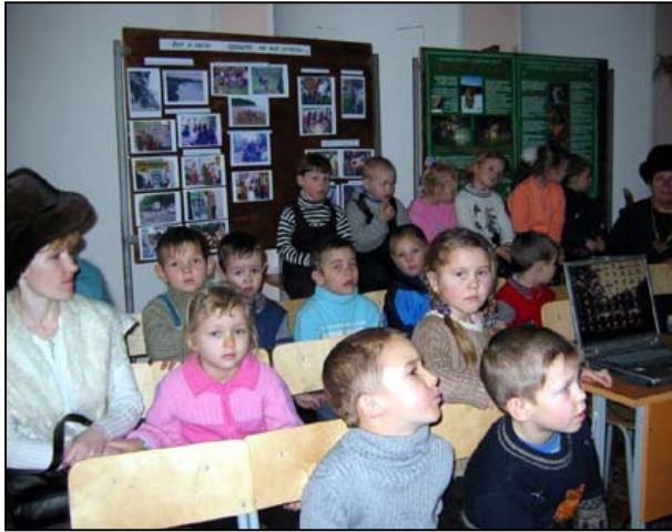
Children attend ecological lesson

handicrafts made of wood, glass, plasticine, nature materials, and fabrics were exhibited on the square. During the holiday the volunteers handed out leaflets with appeal to save Amur tiger population from extinction. Standing next to the tiger posters the children- volunteers told people about tiger biology. A lady in tiger costume treated all participants to special “tiger food”.