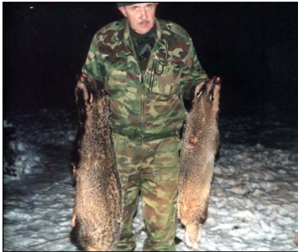
Ranger with two confiscated badgers

thoroughly the rangers found meat of wild boar in a sack. The driver explained that his friend had given it to him, but he did not remember his friend's name. The rangers drew up a report, imposed a fine, and confiscated poached meat. On the same road the team stopped Toyota Surf, in which they found two poached squirrels and a carbine. The driver did not have a permit for hunting. The rangers drew up a report on violations of hunting regulations.