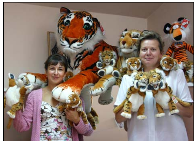
Phoenix staff with fancy tiger toys for awards

This year the holiday has become really international as many events and actions were taken before, during and after International Tiger Day (September 25th) round the world (China, India, Thailand, USA). For example, on the eve of International Tiger Day, Save The Tiger Fund (STF) launched the Campaign Against Tiger Trafficking (CATT) in concert with