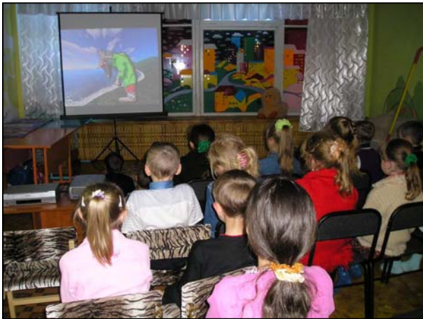
Children watch a film on ecological theme

In June – August there were no eco-classes, because it was the season of summer holidays.