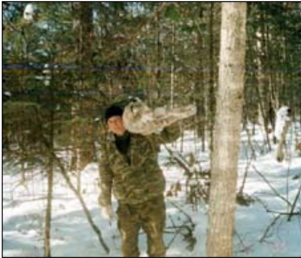
Ranger found a lynx caught in a snare

season without license. The gun and cartridges were confiscated. Criminal proceedings were initiated.