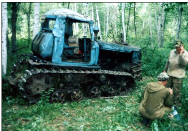
© Phoenix Fund Team found an abandoned tractor

in the identification number of the carriage was changed from 2 to 6. The team also found cedar logs in the camp. The rangers drew up reports on violations, confiscated the vehicles, equipment and rifles and detained 7 men who were later conveyed to police department in Roschino village.