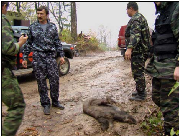
Phoenix Fund Rangers found a wild boar's skin