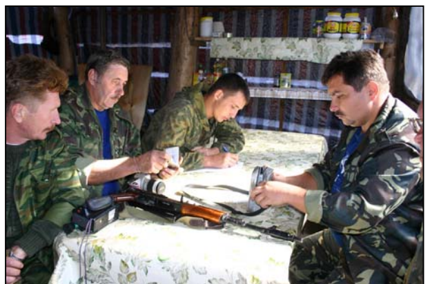
Rangers draw up a report

During a check-up at the apiary situated 500 meters far from an illegal logging site, the team found a rifle without a cover (which is strictly forbidden during the closed hunting season). The rifle was confiscated and a report on violation of hunting regulations was drawn up.