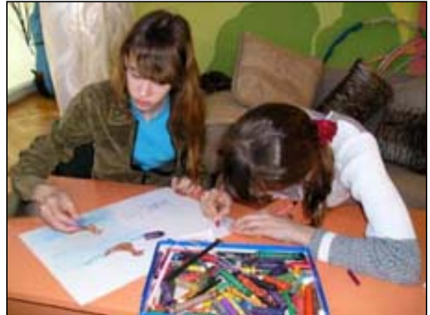
Lesson “Look after the birds!”

On March 17, the “Pervotsvet” eco-centre held an excursion for schoolchildren of Novostroika village. When the children got acquainted with the exhibits at the centre (birds, fishes, guinea-pig), the educator organized a discussion on nature conservation and showed ecological short movies “Coloured windows” and “How children saved a woodpecker”. On March 21, the children’s NGO “Green ecological brigade” organized a seminar on the theme “Less gab - more action”. During the seminar the children reported about their nature –oriented activities in 2004, results and prospects.