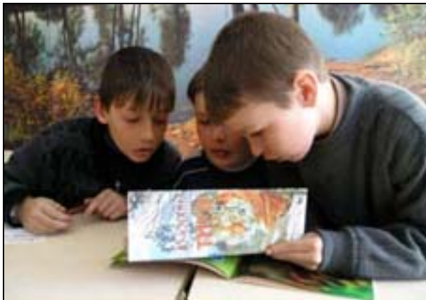
Schoolchildren read tiger leaflets

On the 12 th of January, 25 pupils of the 7 th form attended a lesson on the theme “Animals of our forest” in Ignatievka village of Pozharsky district, Northern Primorye. The teacher told about unique biological diversity in Primorye. The children saw colourful posters with photos and information on Amur tigers and leopards and listened to a lecture on the threats for survival of big cats and ungulates in the Russian Far East.