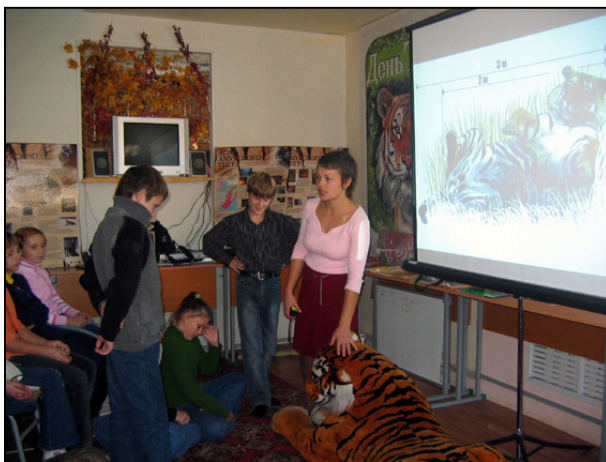
Eco-class in Tiger eco-centre

Since January 2004 the Phoenix Fund has been supporting Tiger eco-centre in Novopokrovka Town, Northern Primorye. In 2005 the teacher carried out over 136 eco-classes and over 300 children visited the eco-centre.