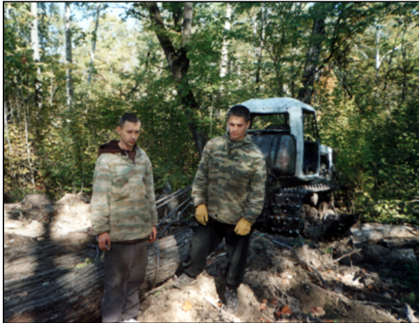
Arrested illegal loggers

On January 03, the joint team patrolled in hunting grounds near Stakhanovets stream and arrested two men for illegal hunting with 6 dogs. The wildlife managers drew up the report on violation, confiscated illegal rifle and imposed a fine. At the same day the team found footprints on the snow and decided to check them. As a result, they found a hand-made rifle in the snow. The owner was not determined.