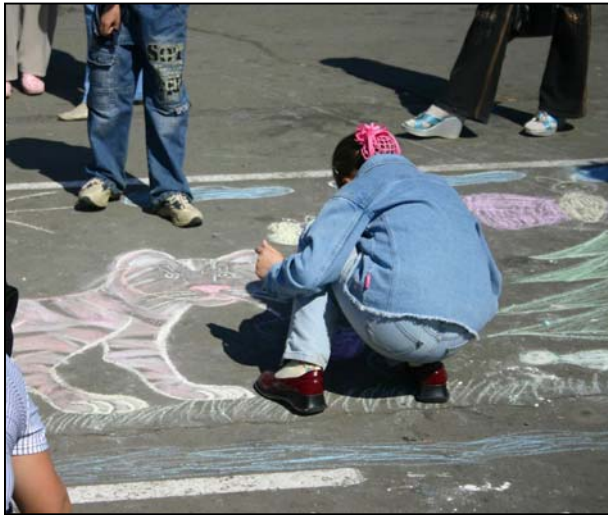
Children are drawing tigers on asphalt

exhibited on the square. During the holiday the volunteers handed out the leaflets with an appeal to save Amur tiger population from extinction. Standing next to the tiger posters the children- volunteers told people about tiger biology. A lady in tiger costume treated all participants to special “tiger food”. The winners of the contests were awarded with memorable prizes.