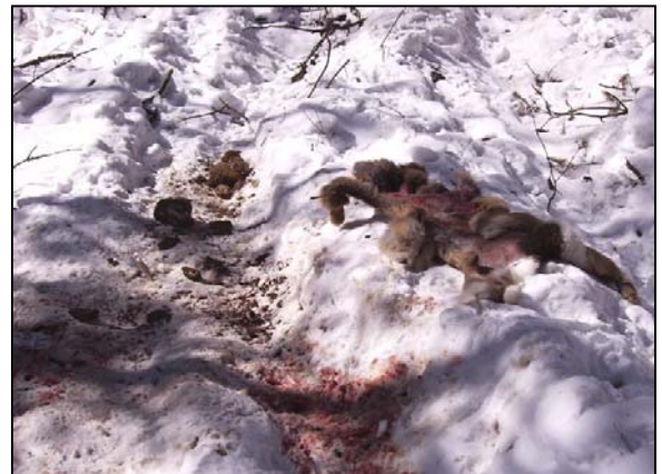
Two roe deer skins found near a logging site on March 30, 2010

On April 9, a man was apprehended on hunting grounds of Dalnerechensky district for illegal waterfowl hunting. He had neither a hunt permit nor gun license. The violator paid a fine of 1,000 roubles ($34).