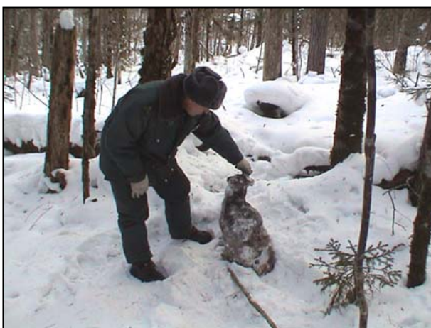
ranger found a dead deer