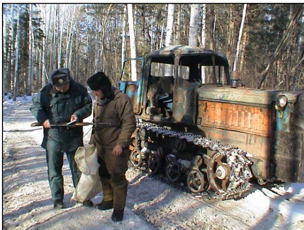
© Inspection Tiger Rangers check gun license and permit to hunt

This project has been made possible in 2007 with the support of the Dreamworld Conservation Fund, the Zoological Society of London (ZSL) and 21st Century Tiger. For the reported period the team conducted 41 many-day patrols, drew up 38 reports on violations of hunting regulations, revealed 27 violations of fishing regulations, seized 28 illegal rifles, 7 fishing nets and investigated 5 conflict tiger cases.