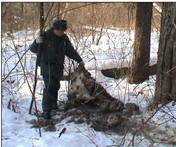
Ranger found a skin of wild animal

On January 25-26, the team checked the message from Khabarovsk Service of Nature Protected Areas that on Khabarovsk – Nakhodka automobile road in Pozharsky district tiger cubs were found. The officers arrived at the place but did not find them. They saw traces of two young cubs 5-6 (2-2.3 inches) and 6-7 (2.4-2.8 inches) paw width at 223-224 km of the road Khabarovsk – Nakhodka. Having followed the traces of the second cub the officers concluded that the animal was not very exhausted. On January 26, they started tracing the first cub with smaller paw width. Analyzing its behavior the specialists concluded that it was not weak either. It ate remnants of meat of red deer. Having perceived it is chased it started moving quicker. It was clear the officers would not be able to approach the animal that day. Returning to the car they decided to search for traces of the third cub, as according to the received information they were three in number. The rangers discovered adult tiger tracks 8-9 cm (3.1 – 3.5 inches) paw width, presumably of a tigress.