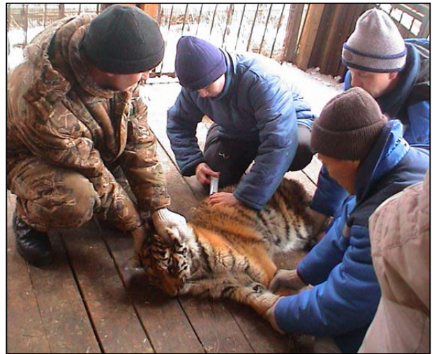
© Inspection Tiger Rangers give the tiger cub an injection

On January 30, the rangers transported an extremely exhausted female tiger cub to the Far Eastern Zoo in Khabarovsk. An apiarist from Lermontovka village of Bikinsky district when walking to his apiary near the Verkhnyaya Birushka spring found a cub aged 4-6 months. It cannot roar or move because of atrophied muscles and weights about 15 kg. Zoo veterinarians accepted it and gave injections of vitamins. They said the animal had very slim chances to survive. Unfortunately, the cub died on February 01.