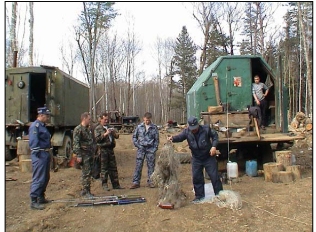
Rangers found illegal fishing nets