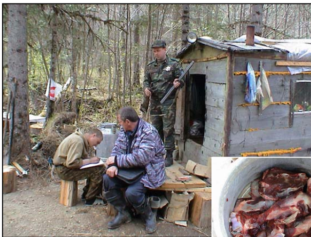
© Inspection Tiger Rangers draw up a report on poaching (big photo). Metal bucket with wildlife meat (small photo)

On April 23-24, the Khabarovsk team rangers, a wildlife manager of Lazo district, and fishing managers of Rosselkhoznadzor patrolled Lazovskoye hunting and fishing society. On April 24, the joint team drew up four reports on violations of fishing regulations and confiscated three rubber boats and seven fishing nets.