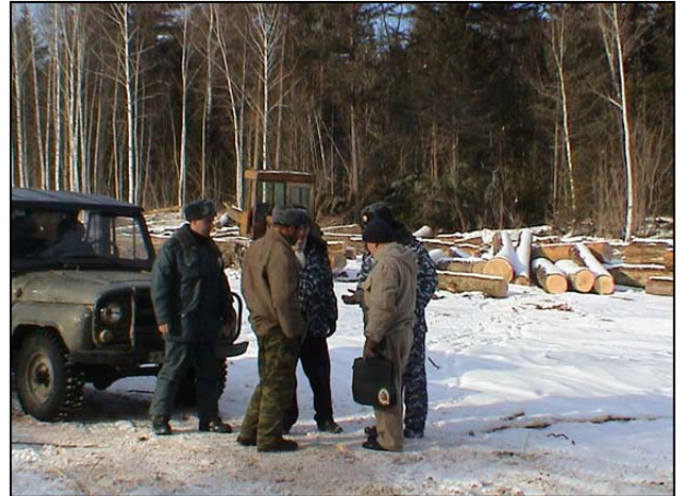
Checking woodcutting area

On January 24, on the territory of the aforementioned forestry the IT officers revealed illegal logging of yew, which is included into the Endangered Species of Russian Federation. The violator, a worker from "Tekhnoles" company sawed a tree 52 cm (20 inches) in diameter and cut off a branch leaving the rest of the tree on the place. He explained that he intended to make a handmade article of it. The team handed the materials to the Department Against Economic Violations of Lazo district.