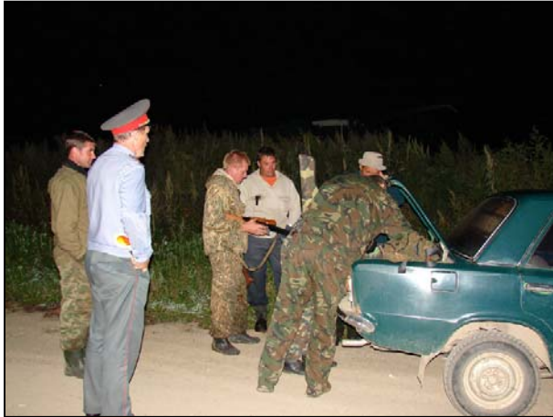
Night joint patrol with police officers

On August 05-07, the team went on a patrol around the territory of Lazovsky hunting and fishing society in cooperation with its gamekeepers. No violations were revealed.