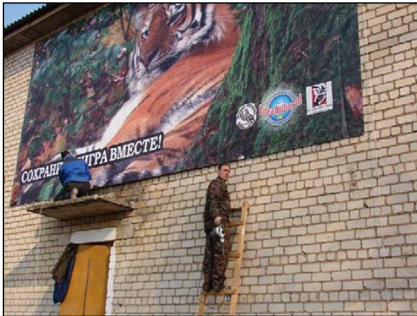
Rangers set a banner on the wall of school in Georgievka village