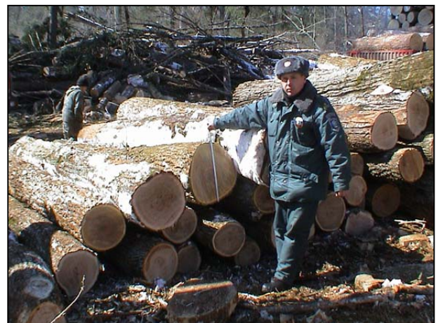
© Inspection Tiger Khabarovsk team officer measures the diameter of felled logs