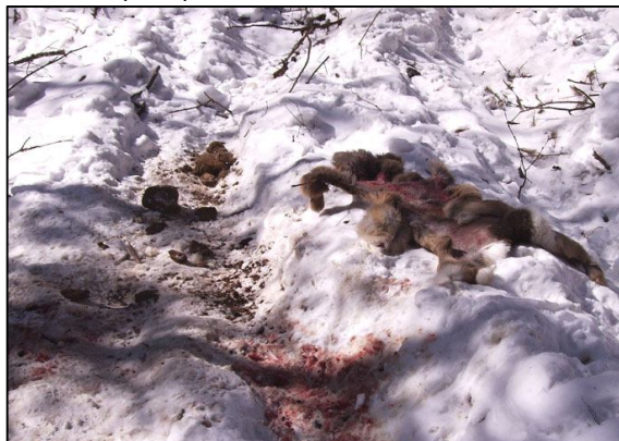
Two row deer skins found near a logging site on March 30, 2010

On April 19, near Salskoye village the team detained a man for illegal waterfowl hunting and made him pay a fine of 1,000 roubles ($34).