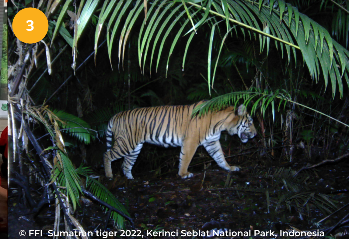
Sumatran tiger 2022, Kerinci Seblat National Park, Indonesia