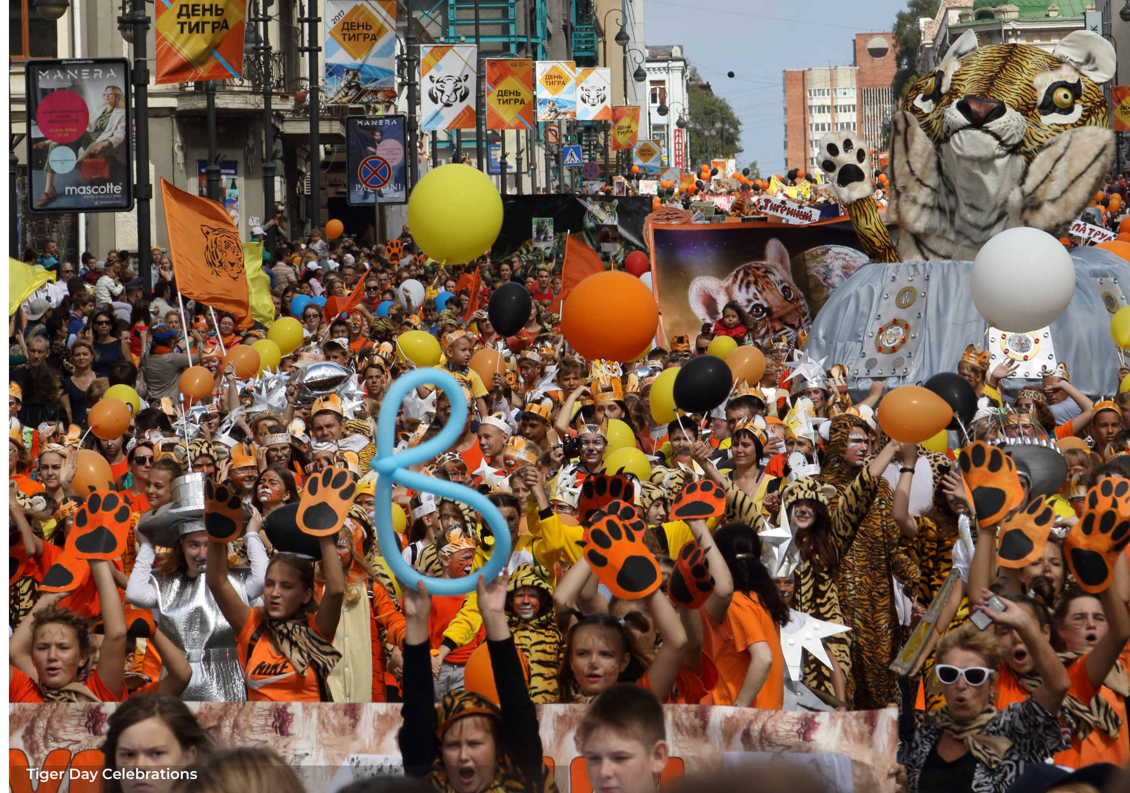
Tiger Day Celebrations

Don't forget to thank all who took part and any companies who donated services. Send emails and letters, you can never say 'thank you' too many times.