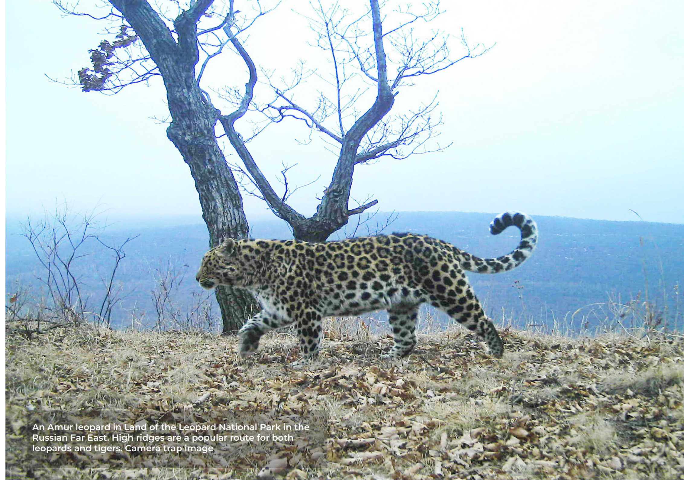
An Amur leopard in Land of the Leopard National Park in the Russian Far East. High ridges are a popular route for both leopards and tigers. Camera trap image

By working together we can keep these charismatic predators safe for future generations.