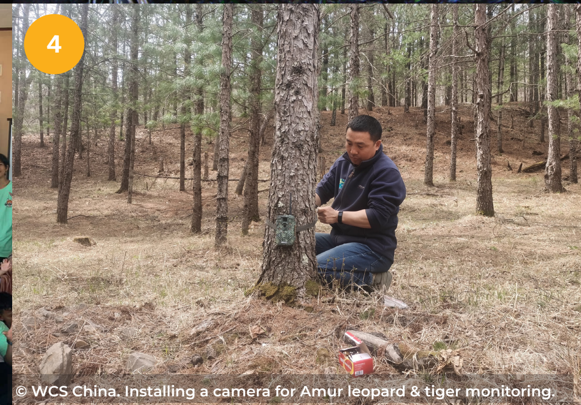
Installing a camera for Amur leopard & tiger monitoring.

Apex predators are the guardians of the forest and all that's in it.