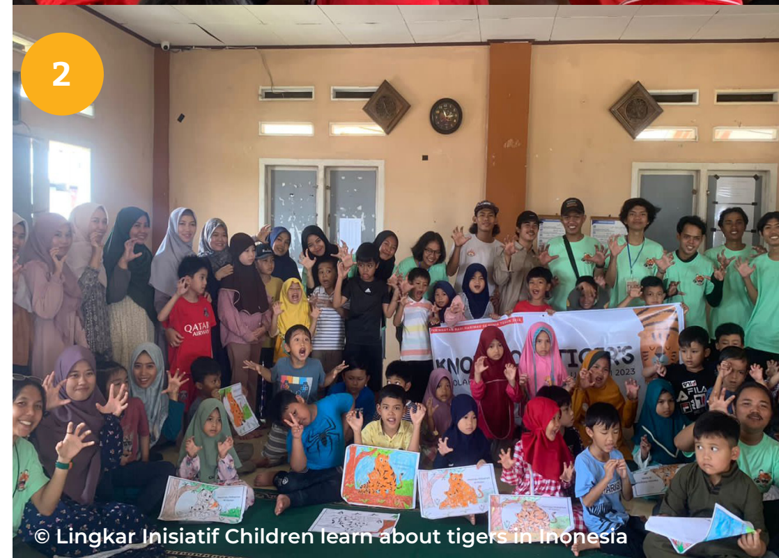
Children learn about tigers in Indonesia