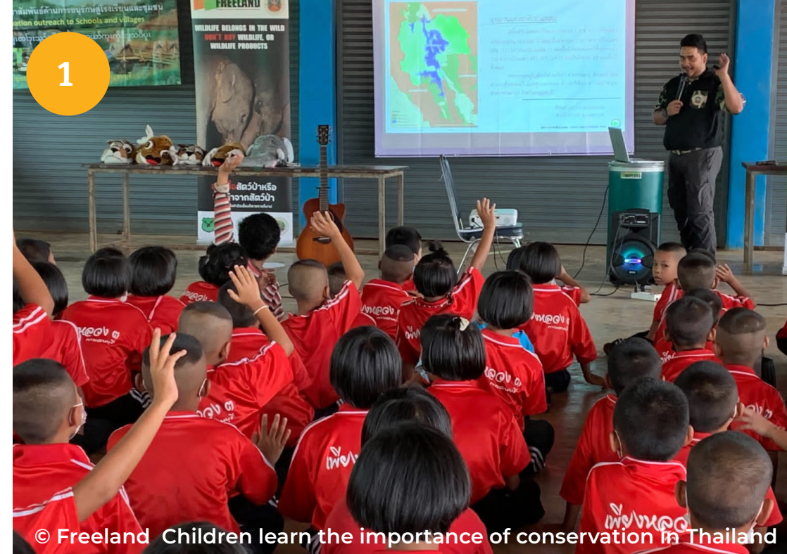
Children learn the importance of conservation in Thailand